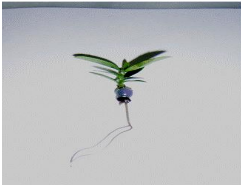
Figure 3. The plant with maximum root length (4 cm) obtained from a synthetic seed for 45 at 4°C.