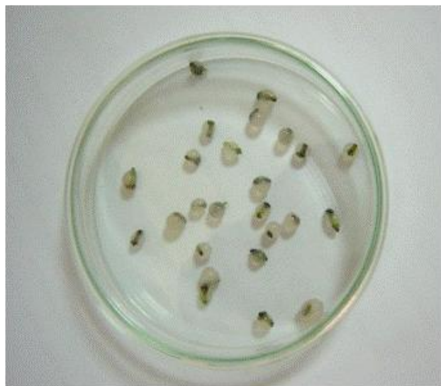
Figure 1. Prepared synthetic seeds.

germplasm are prerequisites for synthetic seed technology and its commercial application. In addition, development of appropriate storage techniques is also obligatory for successful conversion of the synthetic seeds of clonal germplasm of elite and endangered cultivars in the near future (Maruyama et al., 1997). The use of synthetic seeds for obtaining plants has been reported for several crops of economic interest (Redenbaugh et al., 1987; Gray and Purohit, 1991) but for only very few woody species (Rao and Bapat, 1993; Lulsdorf et al., 1993). Keeping in view all these aspects, the present study was therefore undertaken to (1) Study the effect of cold and room storage at different storage intervals on survival, proliferation and conversion abilities of synthetic seeds; (2) formulate a protocol and composition of nutritive medium for room storage in subsequent experiments as energy is a big crisis for storage of synthetic seeds into freezer/refrigerator in developing countries.