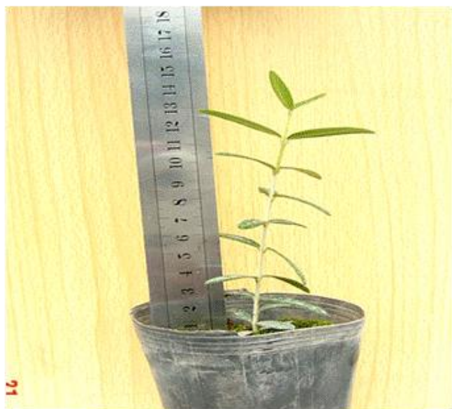
Figure 4. Successfully acclimatized plant.

together on root growth of GF 677 was also found by Tsipouridis et al. (2006).