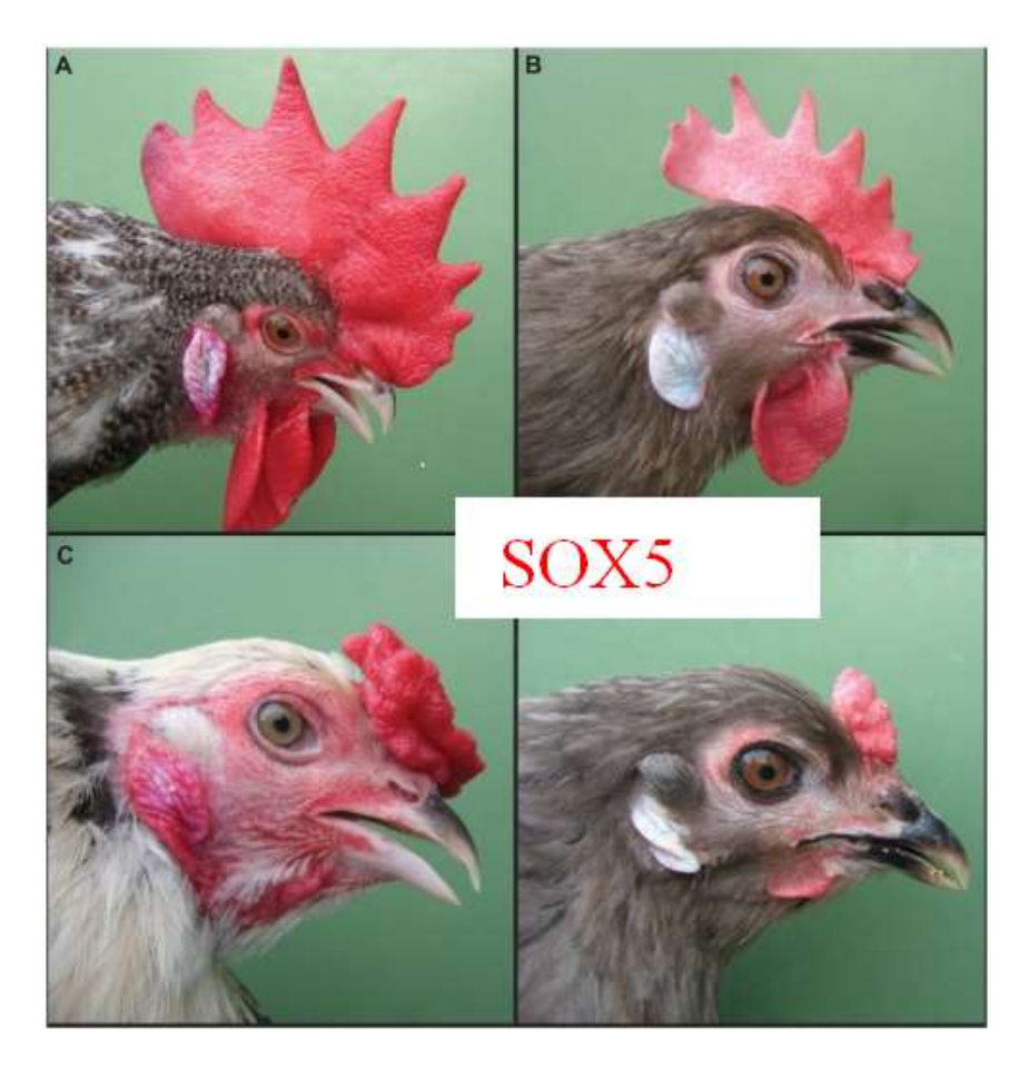
Figure 2. Copy number variation of the SOX5 gene contributes to phenotype (peacomb chickens) (A) Wild-type male, (B) wild-type female, (C) pea-comb male and (D) pea-comb female.

(http://www.world-ometers.info/world-population). Thus. this is an opportunity for animal's breeders to apply genomics selection in livestock in response to demand for livestock products, especially those that have high nutrition (meat and milk). In addition, the development of the Illumina BovineHD BeadChip (Wu et al., 2015; Durán Aguilar et al., 2016; Prinsen et al., 2016; Xu et al., 2016), the Illumina BovineSNP50 BeadChip (Ben Sassi et al., 2016), next-generation sequencing (Bickhart et al., 2012; Keel et al., 2016; Zhang et al., 2016) and whole genome sequence (Keel et al., 2016) have allowed breeders to apply genomic in livestock selection by low cost genotyping (Van Raden et al., 2009). As a result, this genotyping array gives breeders an opportunity to consider young bulls at earlier ages (Bickhart and Liu, 2014).