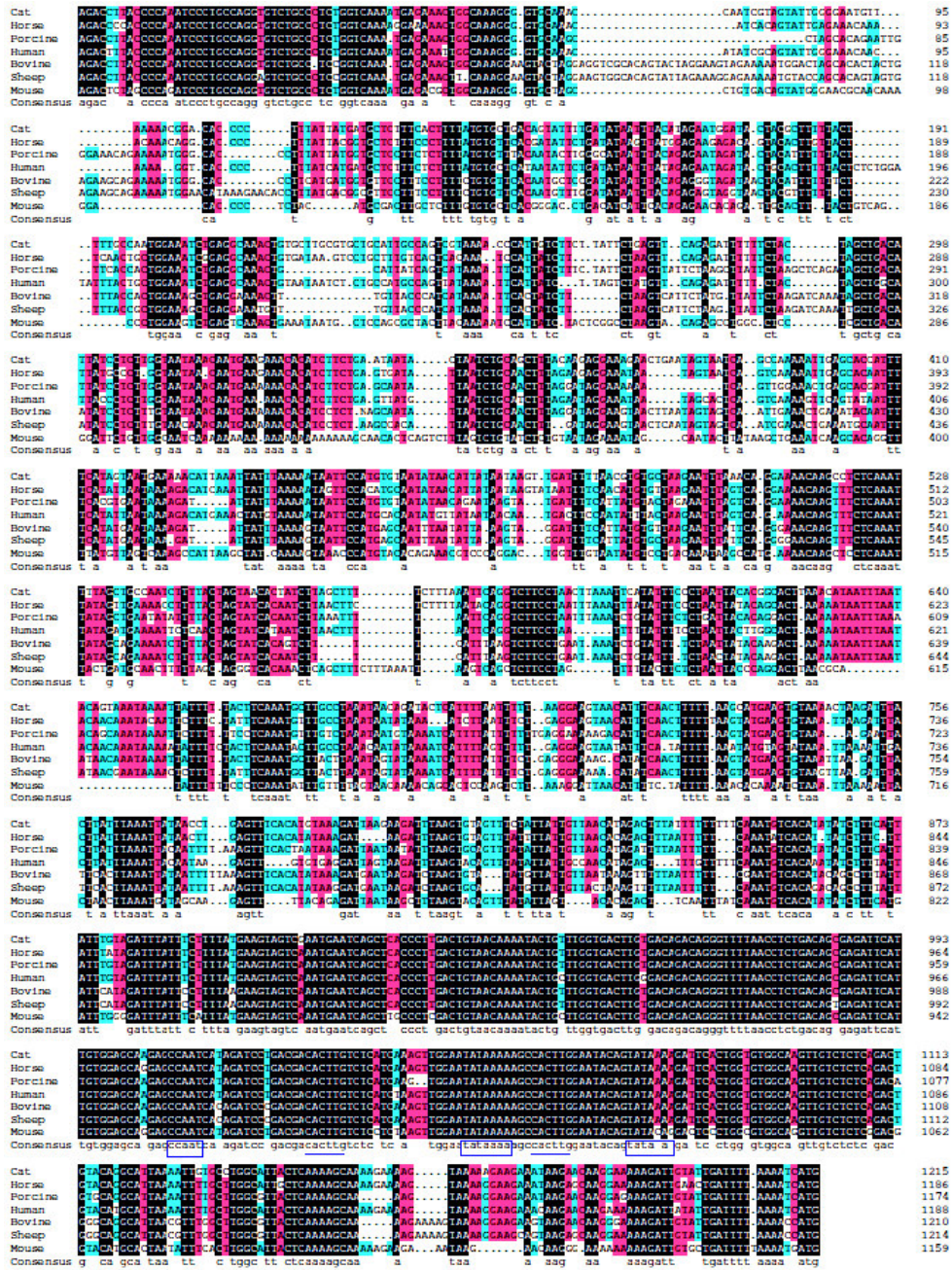
Figure 2. Alignment analysis of the myostatin 5'-regulatory region sequence among cat, horse, porcine, human, bovine, sheep and mouse.