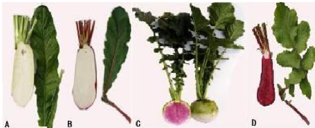
Figure 1. Images of white radish (A), red radish with white flesh (B), green radish with red flesh (C), and red radish with red flesh (D).

areas encompassing 120 million hectares (Wang and He, 2005; Cheng et al., 2013). There are numerous Chinese radish genetic resources possesses numerous, and the vegetable can be differentiated based on root flesh size, shape, and color, as well as by leaf differences (Wang and He, 2005). Chinese radishes are classified according to root skin color, which can be white, red, or green with white or red flesh (Wang et al., 2015b). In China, white radish cultivars are the most widely distributed (Figure 1A). Red radish with white flesh (Figure 1B) is commonly grown in southern China, green radish with red flesh (red-core radish) (Figure 1C) is grown mainly in the north, and red radish with red flesh (Figure 1D) is indigenous to the Fuling region (Chen et al., 2014).