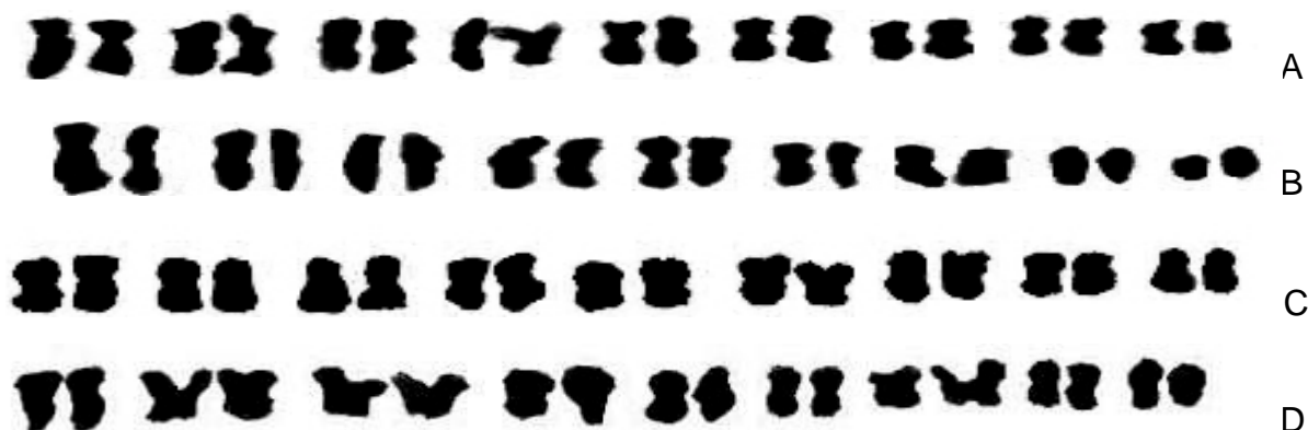
Figure 2. Karyograms of red radish with red flesh (A), green radish with red flesh (B), red radish with white flesh (C), and white radish (D).