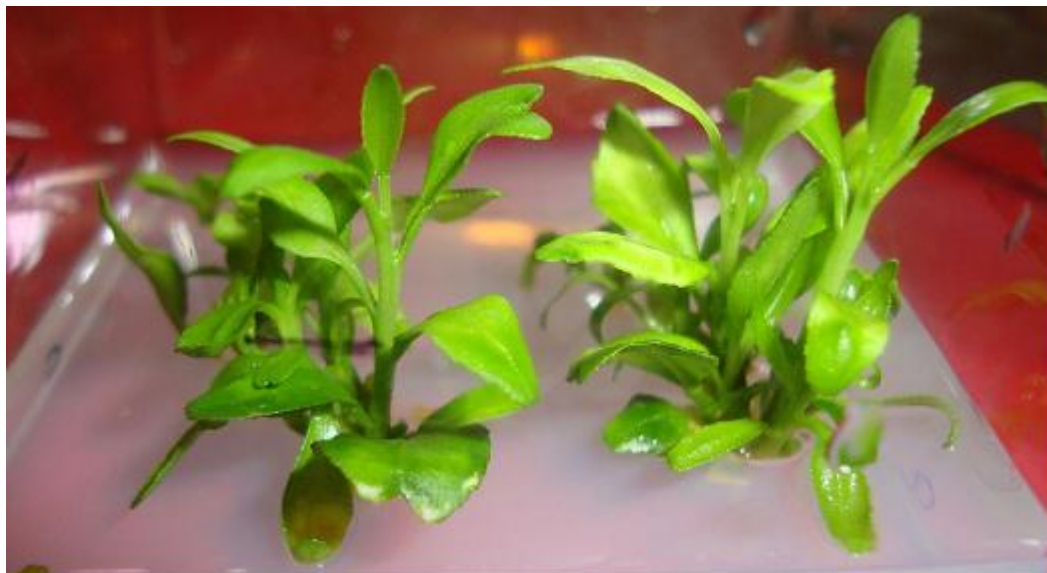
Figure 1. Shoots proliferating from shoot tip explant on MS medium supplemented with 2.5 mg/L BAP.