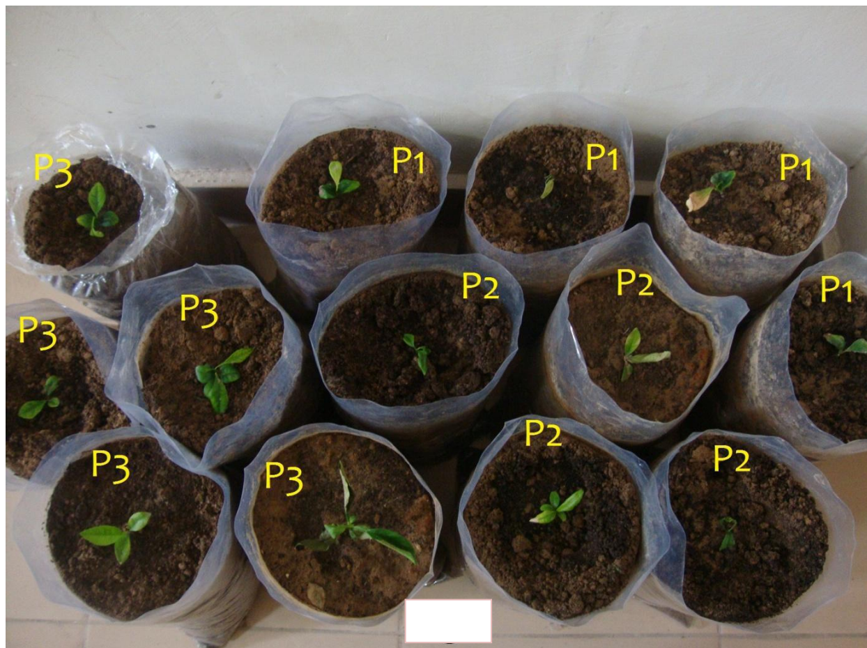
Figure 5. Plantlets, on different potting mixture namely: P1 (sand and soil in 1:1 ratio), P2 (sand, soil vermiculite mixture in 1:1:1 ratio) and P3 (sand: soil: vermiculite mixture in 1:1:2) after one month of acclimatization.

particular, and citrus species in general, is available, to the best of our survey. In the present study, the low level (25 mg/L) of glutamine in the medium increased the shoot multiplication (4.03 shoots per explant) while higher level (100 mg/L) lowered it (1.25 shoots per explant), indicating the requirement of an optimal amount of the supplied amino acid. In fact, instead of a single amino acid, mixture of amino acids like casein hydrolysate was found more supportive in shoot proliferation in the present study; shoot multiplication increased with increase in concentration of CH when supplied individually. Further the defined combination of ADS, Gln and CH (25 mg/L of Gln, 50 mg/L of ADS and 100 mg/L CH) was more suitable (greatly increased the shoot proliferation rate to 7.23 shoots per explant) than their individual's effect; indicating the enhanced availability of some cytokinin like activity as well as better nourishment, to the in vitro cultures at this particular combination.