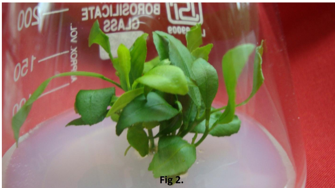
Figure 2. Enhanced shoot multiplication from shoot tip explant on optimal shoot multiplication medium (SMM) having 2.5 mg/L BAP along with 25 mg/L Gln, 50 mg/L ADS and 100 mg/L CH.