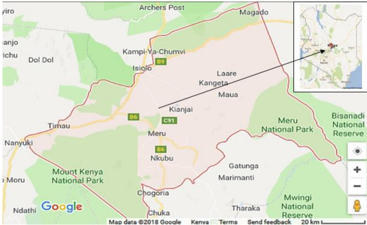
Figure 1. A map showing Meru County.