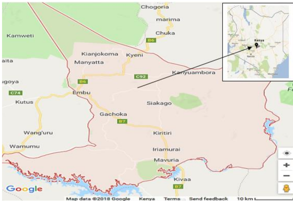
Figure 2. A map showing Embu County.