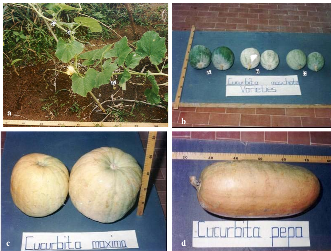
Figure 1(a-d). Characteristic features of habit and fruits Cucurbita species studied. a-habit of Cucurbita species showing severely coiled tendrils represented with letter 'a'; b- three fruit varieties of C. moschata . ; these varietal forms are occasionally produced by one plant; c-fruit of C. maxima ; fruit stalk is deeply depressed into the fruit forming a globose invagination ; d- fruit of C. pepo ; fruit stalk is round, neither depressed nor sunken into the fruit.

anatomy will also provide a guide and basis for studies leading to further exploitation of these important vegetable species.