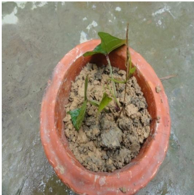
Figure 6. Regenerated plants established in pots.

length. Explants cultured on media (MS + 2.0mg/L IAA + 1.5 mg/L Kn) showed highest shoot length within three month. Auxin (IAA) was very effective in bud breaking and shoots formation. Number of shoot induced per explant by the effect of IAA (2.0 mg/L) was also very satisfactory (Figure 5). Kinetin (1.5 mg/L) with IAA (2.0 mg/L) enhanced shoot multiplication and also increased number of node.