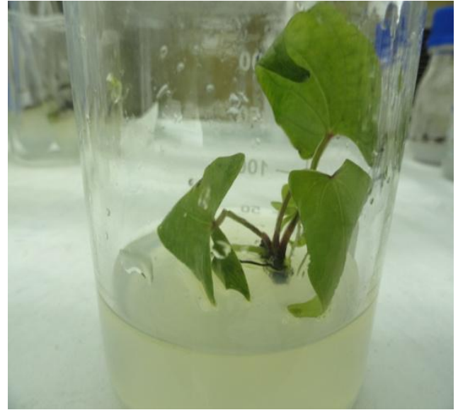
Figure 3. Showing Growth after 45 days.