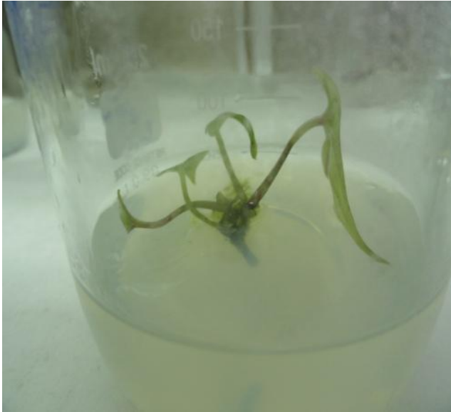
Figure 2. Multiple shoot regeneration.