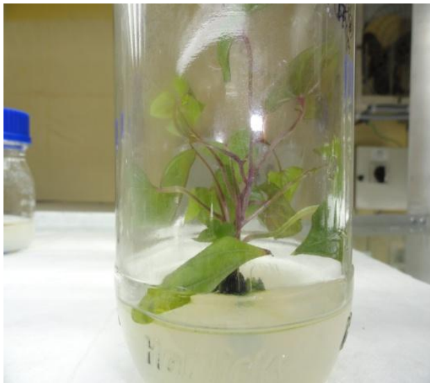
Figure 4. Showing Growth after 75 days.