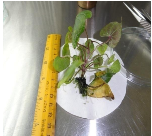
Figure 5. Showing Shoot number in regenerated plants.

cytokinin required optimal quantity in many genotypes but addition of low concentration of auxin with cytokinin triggered shoot proliferation (Sengupta et al., 1984). In this study, low concentration (1.5 mg/L) of kinetin with high concentration (2.0 mg/L) of IAA induced shoot proliferation; further increase of kinetin concentration after optimal concentration (1.5 mg/L) decreased shoot length. The result was supported by this work which shows that suppression of kinetin increases shoot length, node number and root length (Jha and Jha, 1998). In Dioscorea composita only auxin NAA, IAA and IBA at 1.25 and 2.5 mg/L account for promotive effects of in vitro shoot growth (Ondo et al., 2007).