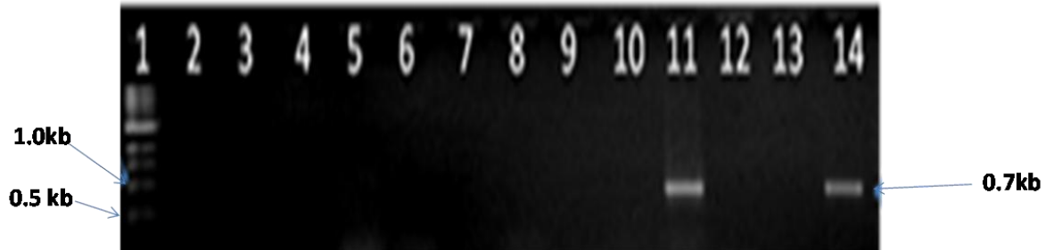
Figure 3a. Testing of J. curcas seedlings before whitefly inoculation by PCR using ACMV-specific primer pair, JSP001/JSP002. Lane 1 = 1 kb DNA ladder; 2 = Hohoe; 3 = Kasoa; 4 = Apeguso; 5 = Kpeve; 6 = Addogon; 7 = Valley View University; 8 = Asamankese; 9 = Gbefi; 10 = Aklamado; 11 = ACMV-infected cassava (positive control); 12 = Amanfro; 13 = water control; 14 = positive control.