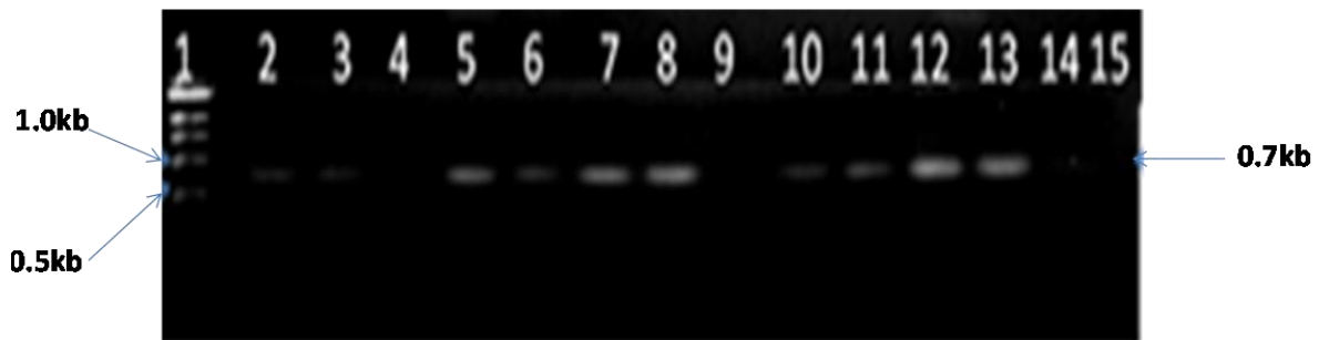
Figure 3b. Testing of J. curcas plants 21 days after whitefly inoculation by PCR using ACMV-specific primer pair, JSP001/JSP002. Lane 1, 1 kb DNA ladder; 2, Hohoe; 3, Kasoa; 4, Apeguso; 5, Kpeve; 6, Addogon; 7, Valley View University; 8, Asamankese; 9, Gbefi; 10, Aklamado; 11, Amanfro; 12 and 13, positive control; 14, uninoculated J. curcas and 15, water control.

Amanfrom, gave the highest positive absorbance of 1.006 whilst the least (0.397) was from Asamankese accession.