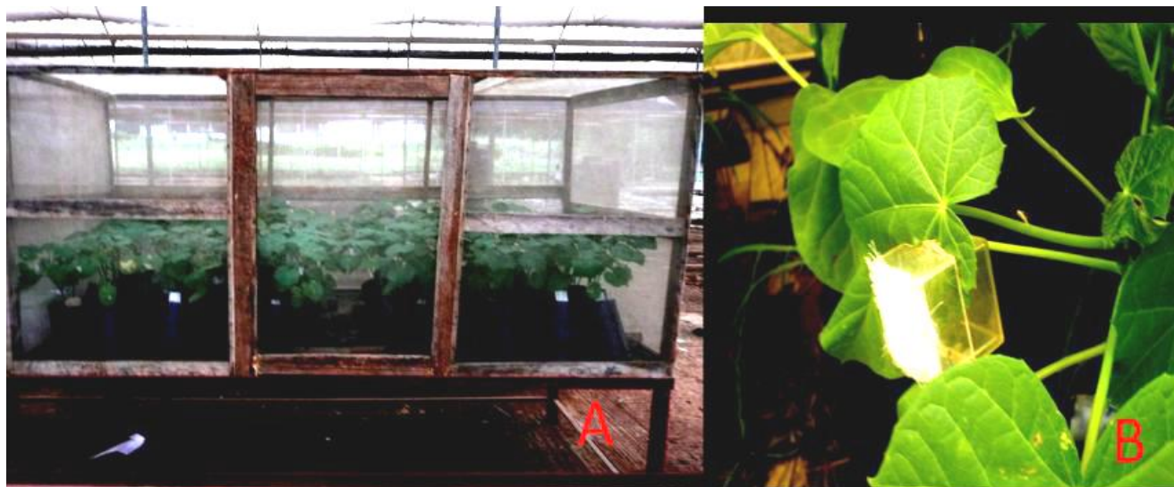
Figure 1. A, Insect-proof cage (3 x 1.2 x 1.3 m) with J. curcas seedlings. B, clip cage containing trapped B. tabaci and attached to a leaf of Jatropha seedling to facilitate access feeding.

known to be vectors of plant viruses, with B. tabaci being the most important, transmitting about 111 virus species (Brown et al., 1995) including cassava mosaic Gemini-viruses (CMGs) (Legg et al., 1992).