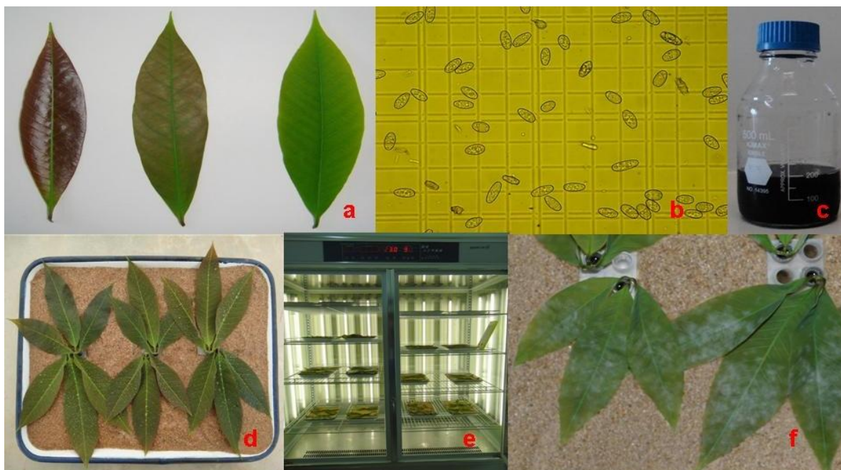
Figure 1. In vitro culture of powdery mildew ( Oidium heveae ) of Hevea brasiliensis . a, three kinds of phenological phase leaves of bronze, Colour and light green of GT1; b, fresh powdery mildew asexual conidia; c, NS7 nutrient solution; d, Colour phase leaves with nutrient solution in culture dish; e, in vitro culture in climate incubator; f, Colour phase leaves cultured for 9 day of GT1.

consequently aid in its research and improve rubber resistance breeding process. In this study, the influences of 6-benzylaminopurine (6-BA), salicylic acid (SA) and vitamin C (VC) of nutrient solution for in vitro culture were investigated by orthogonal experimental design.