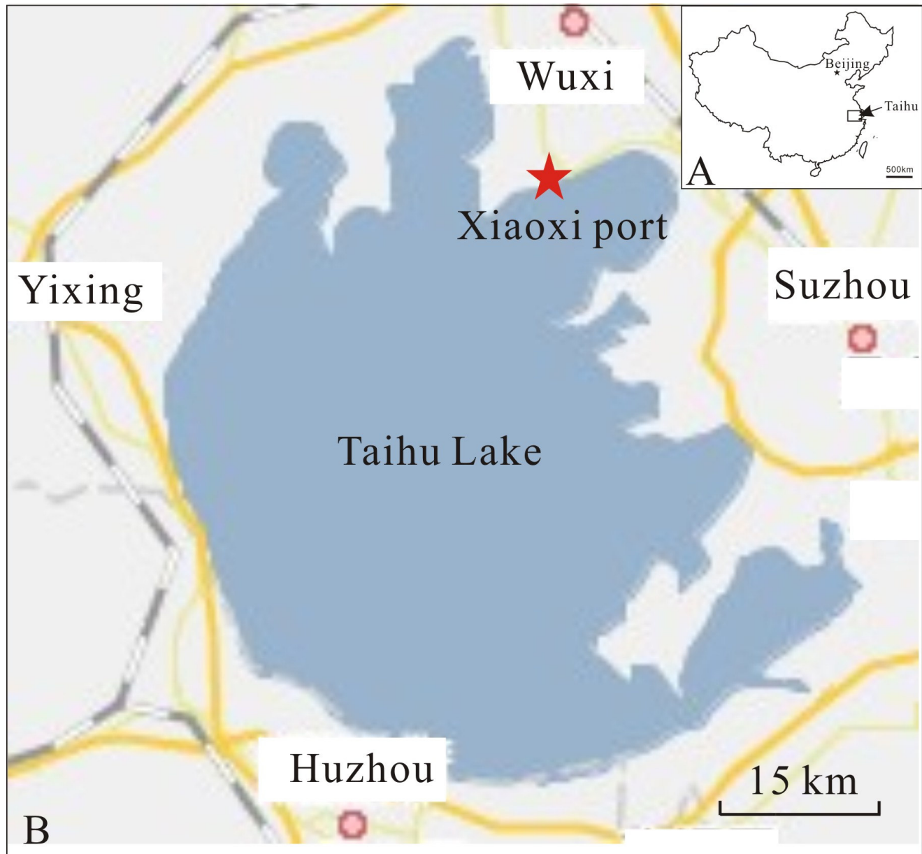
Figure 1. Location of the study area.

identification method, with otolith-identification method described by Liu (1995), Yin (1995) and Ye and Zhang, (2002). This method is described as follows: the scale was put on a glass slice, covered with a thin glass slice and fixed with adhesive tape. Observation was made under OLYMPUS microscope. According to the indexes of annual ring for scales of sparse-dense type, incision type and fragment type, the locations and number of annual rings were determined. Taking into consideration the forming time of the annual rings of the scale and otoliths of the carps from the Dongjiang River, Guangdong Province, which is February to March for the first ring and mainly March to April for the second and the other rings, respectively (Ye et al., 2002), the time of the ring can be estimated. Considering the distances of the first ring to the second ring and to the core, the starting time for the growth of the scale can be estimated; similarly, based on the distance of the outer ring to the margin, the closing time for the growth of the scale