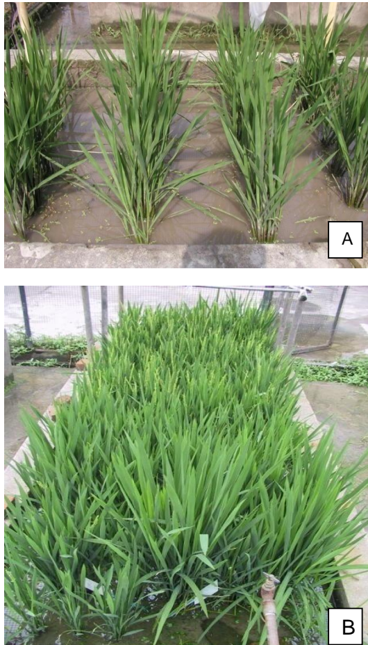
Figure 1. Sowing pattern of ZAU11S106 and ZAU11F121 for SDLLT. PGMS rice ZAU11S106 was sown in concrete troughs in rows each with 6 plant and allowed to grow for 57 days after which SDLLT was started. Plants were covered from 4.00 to 9.00pm when complete darkness set in so as to be exposed to only 11 h of daylight. Figure a shows plants at initiation of SDLLT and Figure b shows plants at cessation of SDLLT. In Figure 1 a only four rows appear (others were not captured) but Figure b show the total size of trough and number of rows. Plants given SDLLT flowered earlier than those which did not (Figure b).

yellow or colourless with 1% I/KI indicating that they were of abortive type (Figure 4b). Therefore, SDLLT after 73 days old could not induce fertility and pollen cells were of abortive type. When plants were given SDLLT between 69 and 73 days old for 12 days they were fertile and allowing them to grow under LDLL growth conditions for 16 days could not prevent some pollen to stain blue-black with 1% I/KI solution indicating that they are of fertile type. Transformation of pollen from sterile to fertile and vice versa was found to occur between days 73 and 77 old after sowing. This is the critical period of pollen transformation. Once sterility or fertility reaction take place during the critical period, transformation is irrever-