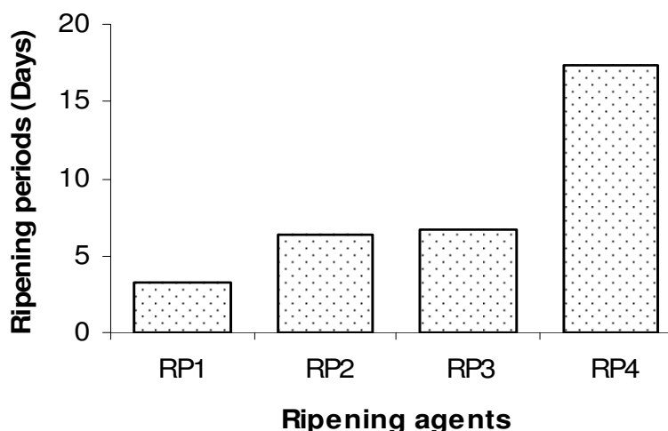
Figure 1. Ripening periods of blossoms of plantain as affected by different ripening agents. RP1 = Ripened plantain blossoms using N. laevis leaves as ripening agent; RP2 = ripened plantain blossoms using calcium carbide as ripening agent; RP3 = ripened plantain blossoms using I. gabonensis fruit as ripening agent; RP4 = ripened plantain blossoms with zero ripening agent as control.

UP = Unripe plantain blossoms, RP1 = ripened plantain blossoms using N. laevis leaves as ripening, RP2 = ripened plantain blossoms using calcium carbide as ripening agent, RP3 = ripened plantain blossoms using I. gabonensis fruit as ripening agent and RP4 = ripened plantain blossoms with zero ripening agent as control.