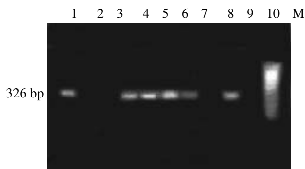
Figure 2. PCR detection of transgenic plants. M: DNA marker, 1-7: genomic DNA of transformed plant, 8: non-template (negative control), 9: plasmid pGA643 (positive control), 10: genomic DNA of non-transgenic plant (negative control).

precultured 2 and 3 days respectively before they were inoculated with agrobacterium . This decreased the number of explants which turned brown. The effect of preculture for 3 days was better.