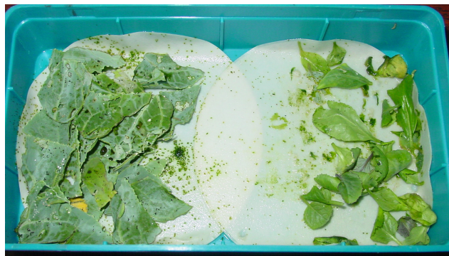
Figure 4. Preliminary insect-resistant assay of transgenic plants. The left leaves were detached from non-transformed plants, and the right leaves were detached from transgenic plants.