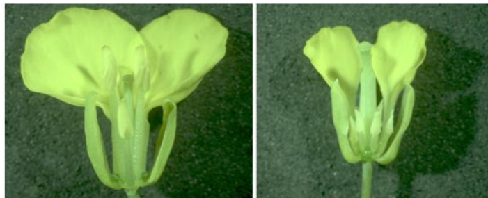
Figure 1. A: Fertile plant in NIL population; B: Sterile plant in NIL population. Pictures were captured under Leica DC300 microscope at a magnification of 0.8x field lens and 10x eyepiece.

PCR and the following secondary PCR were performed with primer combination of AP1 or AP2 and the corresponding gene-specific primer. The PCR products of the secondary PCR were separated by electrophoresis through 1.2% agarose gel. Bands of interest were then purified, cloned and sequenced. Total size of PCR walking flanking sequences and original AFLP marker sequences were combined with DNASTAR 5.0 software for sequence Blastn ( http://blast.ncbi.nlm.nih.gov/Blast.cgi ) analysis.