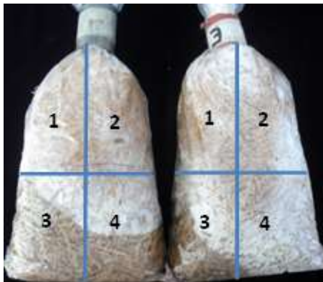
Figure 1. Superficial mycelia colonization in bags with substrate. 1, 2, 3 and 4 represent quadrants for the evaluation of percentage of colonization. Each colonized quadrant represents approximately 12.25% of bag superficial area.