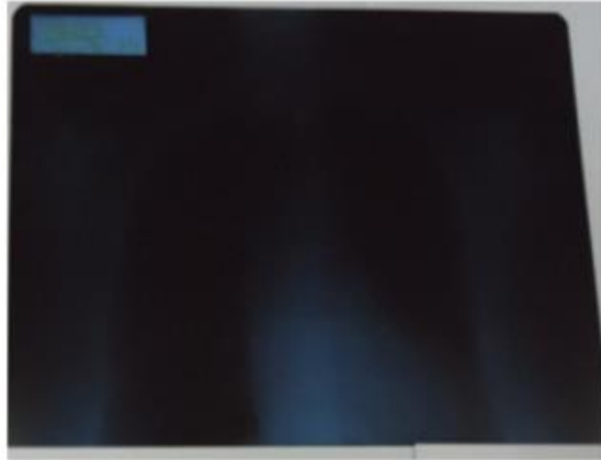
Figure 1. X-ray film used in this study as control which contains silver in gelatin-coated film made from polyester layer.