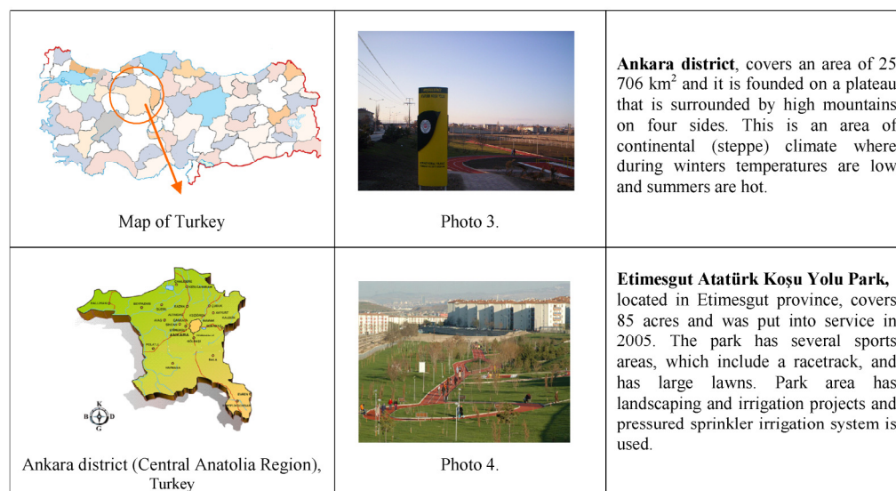
Figure 2. Etimesgut Atatürk Koşu Yolu Park (Ankara/Central Anatolia Region), Turkey.

importance of determining the water needs of plants in the preparation of irrigation projects.