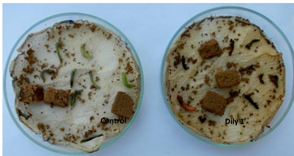
Figure 2. Insecticidal activity of B. thuringiensis isolate Dily1 against H. armigera larvae.

between 70 and 55% of H. armigera larvae (Table 5). As observed in this work, Bravo et al. (1998) and Crickmore et al. (1998) indicate that, the most known proteins on Lepidoptera are encoded by the Cry1, Cry2, and Cry9 genes.