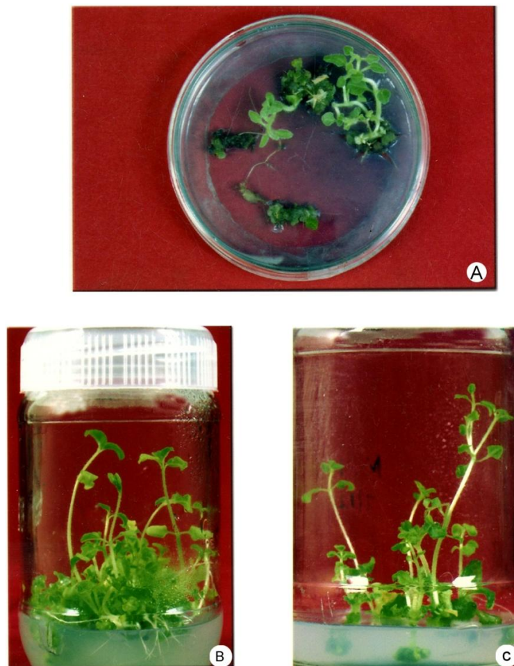
Figure 2. Induction of shoot buds from leaf callus of P. barbatus . A and B, Development of multiple shoots from leaf derived callus culture. C, adventitious shoot bud regeneration from node explants.

**Significant at 1% level. Data represents average of 3 experiments with 10 replications.