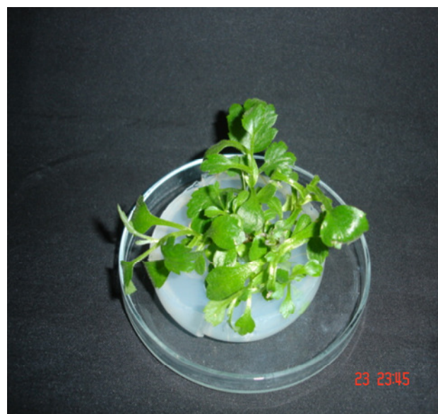
Figure 1. Shoot formation derived from ray floret explant.