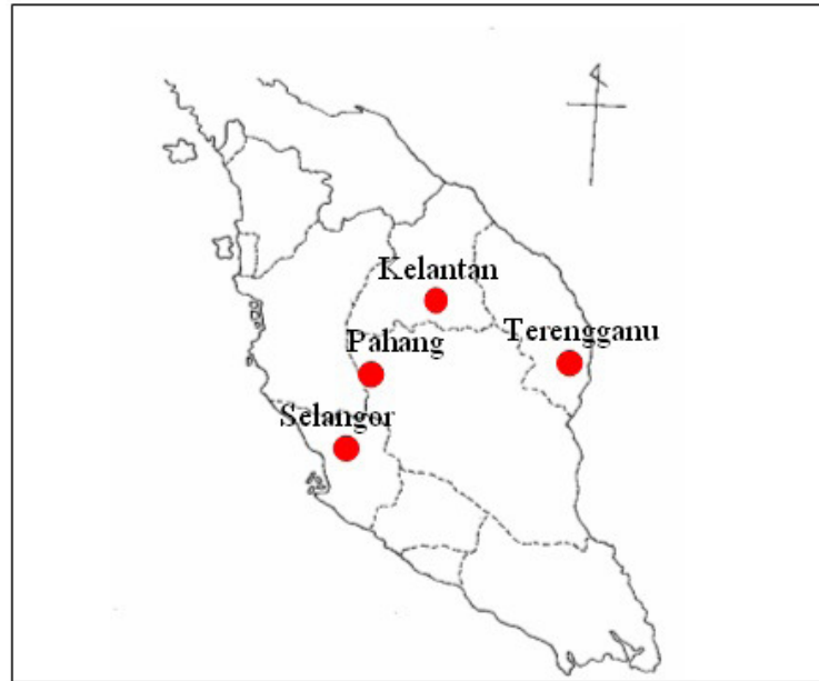
Figure 1. Map of Peninsular Malaysia showing the infected areas i.e. Selangor, Pahang, Terengganu and Terengganu (Sijam et al., 2008).