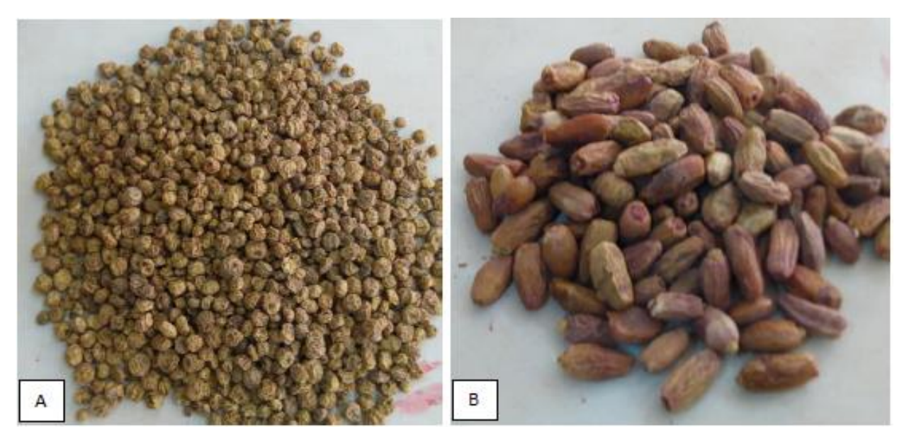
Figure 1. Photographs of Cyperus esculentus nuts (A) and Phoenix dactylifera fruits (B).

In Nigeria, it is referred to as "dabino" by the Northerners who often sell it at different markets and strategic locations. The fruit is sweet, oval-cylindrical in shape and serve as energy booster. The name (dactylifera) of the species is used to explain the clustered nature (usually referred to as "finger-bearing") of the fruits produced by the plant. The production of the fruits has increased over the years because of its increasing demand and because it is economical. The fruit is believed to possess lots of medicinal properties. The fruits may be eaten alone or in conjunction with other food materials. Date fruit has been reported to be of high nutritional value and also a good source of vitamin B complex (Eoin, 2016). Therapeutic properties of date fruits, such as anti-proliferative, antibacterial, antioxidant and antifungal have been reported by Al-Alawi et al. (2017). It is believed to be a good aphrodisiac.