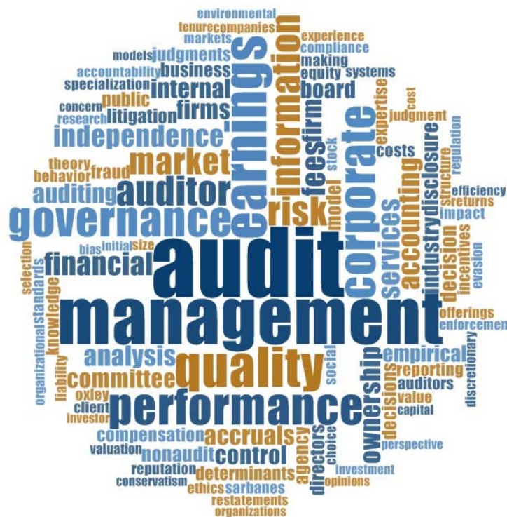
Figure 2. Cloud of keywords terms.

P = Number of publications; \bar{c} = Average of citations per year.