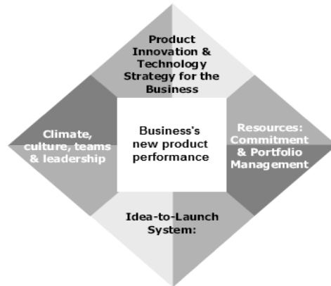
Figure 1. Innovation diamond.

posited that “if companies can improve their effectiveness at launching new products, they can double their bottom line. It’s one of the areas left with the greatest potential for improvement.” Many studies have focused on success or failure of NPD associated with CSFs. A selection of such studies are reviewed and summarized in Table 1.