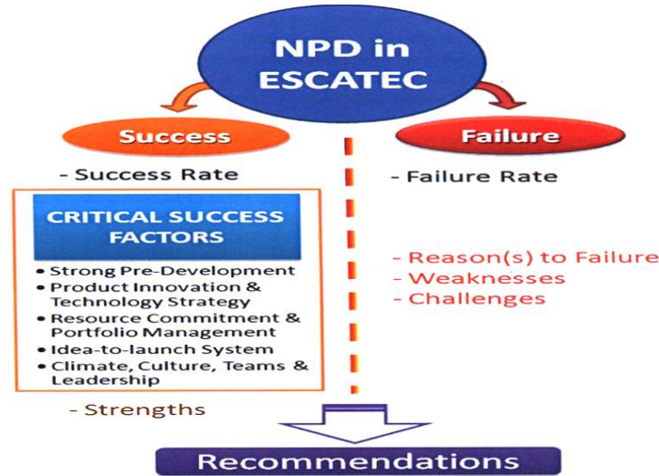
Figure 2. Research framework (NPD in ESCATEC, 2005).