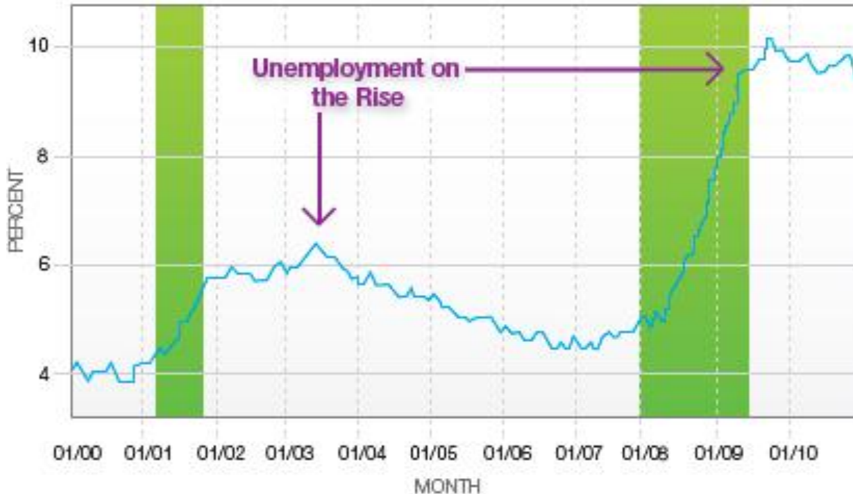
Figure 1. Unemployment trend in US. Green areas represent recessions.

which people protest or behave violently. Social unrest starts when citizens are not satisfied with government rules, regulations and policies. They start indulging in anti-social welfare deeds just to satisfy their personal or group needs, violate norms, beliefs and values as much as they can. Social unrest can be caused by many unexpected things mainly economical recession, unemployment, crushing of personnel self esteem, financial crises and psychological and physical illness, unavailability of a sound livelihood, etc. the following map indicates the state of social unrest in 2010.