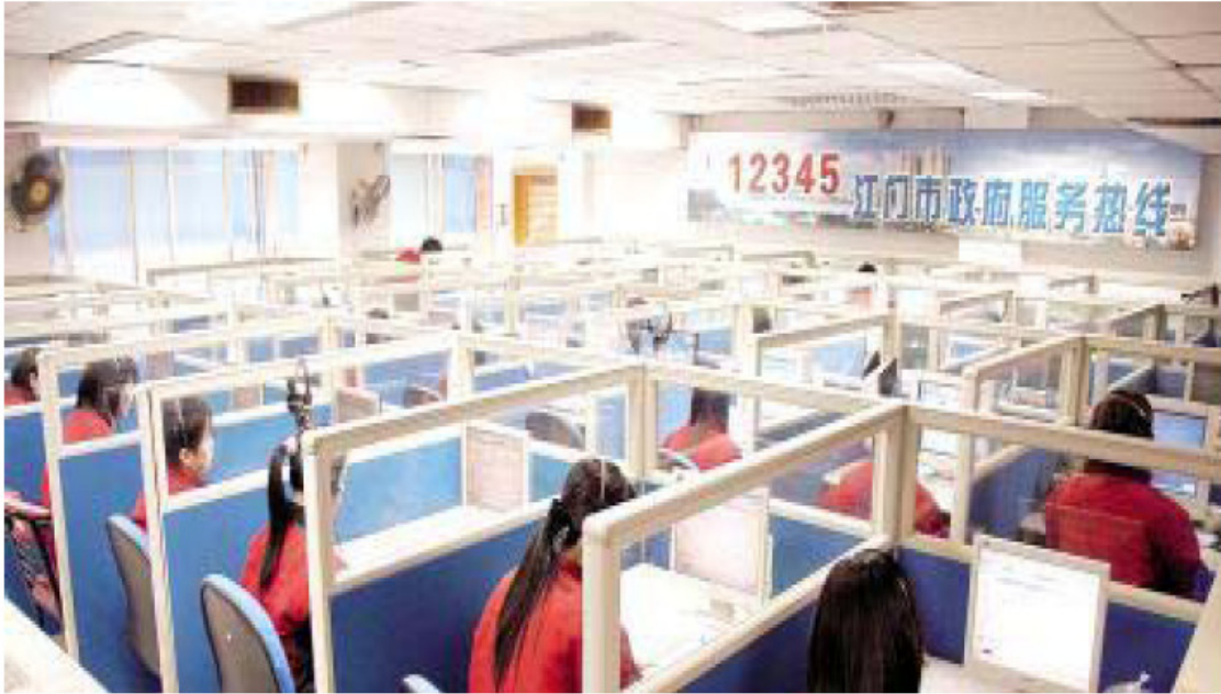
Figure 2. The working station of the “12345” service hotline center of Jiangmen city.

As a comprehensive service platform and an important way to satisfy the public demand, the “12345” service hotline had extended its influence sphere to various departments and districts. The public can dial “12345” at any time and the call will be directed to the service hotline center. Thus, it prompted the public to put forward their opinions about the city development and facilitated the provision of public service. The “12345” service hotline ensures the opinions, proposals and demands of the public entering a rigorous process of record, supervision, coordination, answer, tracing, feedback, examination, responsibility investigation and so on. So, the problems from the public can be solved as soon as possible or a satisfactory reply is given. For those that cannot be solved in a given time span or those that have not obtained satisfactory answer, the hotline center will report them to the leaders of the relevant departments and make sure the complaints were solved effectively. For repeated complaints and unsolved problems, the city leaders will review the matter and hold a meeting to find a satisfactory solution to the problems.