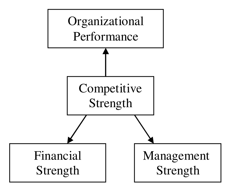
Figure 1. The theoretical model.

measure of financial strength of a company. The higher the value of the Z-score, the stronger is the company financially. Another four pieces of data on management strength of the companies are also provided - asset turnover (Asset T/O), gross margin, free cashflow to capital, and return on shareholders equity (ROE). We inspected the data provided and found that there is too many missing information on free cashflow to capital. We decided not to use the data and substitute the factor with sales margin, calculated by dividing Sales with earnings before tax, depreciation, and amortization