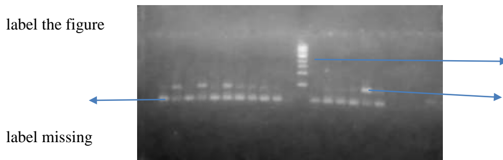
Figure 2. HPV detection using nested PCR MY09/11 and GP5+/ GP6+ consensus primer, Lane 1-14, 15- 35 and 36-44 represents the samples. Lane M represents the Quick-Load 100bp DNA molecular ladder.

of oncology research projects by screening for genetic markers from archived tissues (Koshiha et al., 1993; Olert et al., 2001). DNA extraction and polymerase chain reaction amplification are fundamental in DNA assays. The accessibility and quality of the DNA obtained is therefore important in macromolecules studies and thus for proper DNA extraction the macromolecules must be properly fixed. Fixatives used for preserving archived tissues can not only be used to maintain the tissues structures but also to protect macromolecules from degradative processes (Schander and Halanych, 2003) and understanding how fixatives affect the molecular quality and interference with results of the molecular assay is important (Srinivasan et al., 2002).