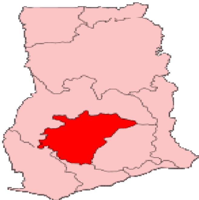
Figure 1. Map of Ghana with Atwima Nwabiagya District (Nkawie).