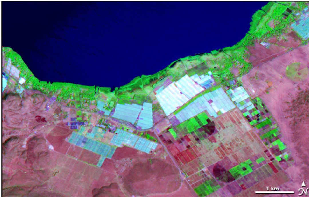
Figure 2. The region around Lake Naivasha in Kenya produces fresh cut flowers that supply the demand in Europe at the cost of pesticide loading of the ecosystem, affecting aquatic life including fish and large animals such as the hippopotamus.