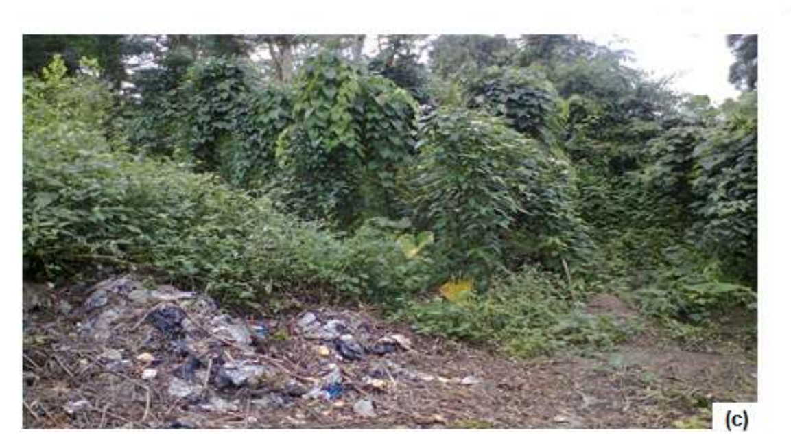
Figure 2. (a) Dumpsite. (b) Representative of the sampling points W2 to W5. The locations are covered by vegetation in Figure 1. (c) Farming activities on hospital waste dumpsite.

14.3%); only 8.9 and 2.4% was found in the organic matter fraction during dry and wet seasons, respectively.