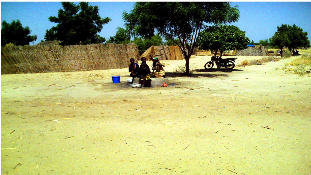
Plate 2. Dambore Resettlement Camp.