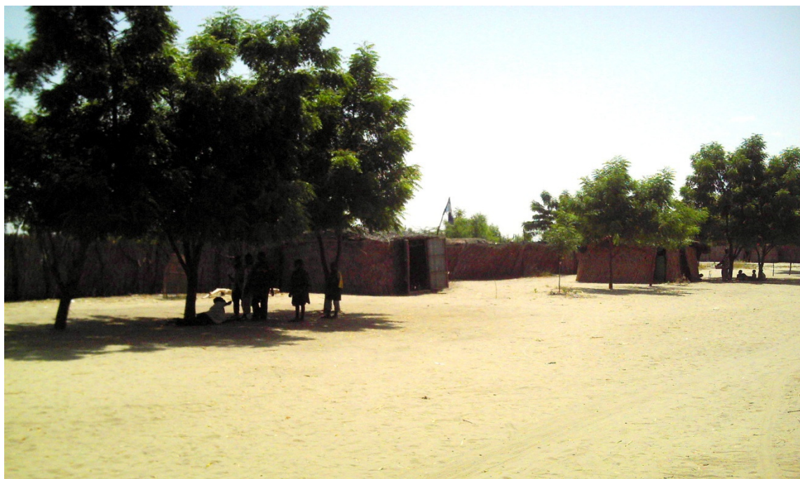
Plate 3. Ali sheriffti camp showing planted trees.

believed that the resettlement exercise have had negative impact on migration because many of the returnees could not cope with the situation on ground and as such have to migrate in search of better fishing grounds or farming areas. They also believed that the resettlement exercise have strong negative impact on damage to