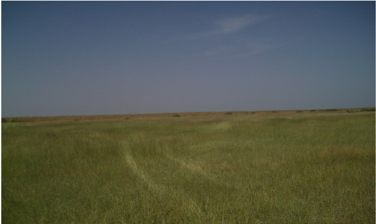
Plate 1. Nature of Ali Sheriffiti before the resettlement scheme.

39.9% on this factor. The pattern of distribution of these scores on the 5-point Likert scale, show that majority of the respondents are convinced of the obvious advantages of the services provided by the resettlement scheme (SERVICE) and the facilities attracted to the resettlement areas (FACILITIES). Therefore, factor II reflect the socio-economic benefit and factor I, the socio-economic cost of the resettlement scheme on the immediate environment.