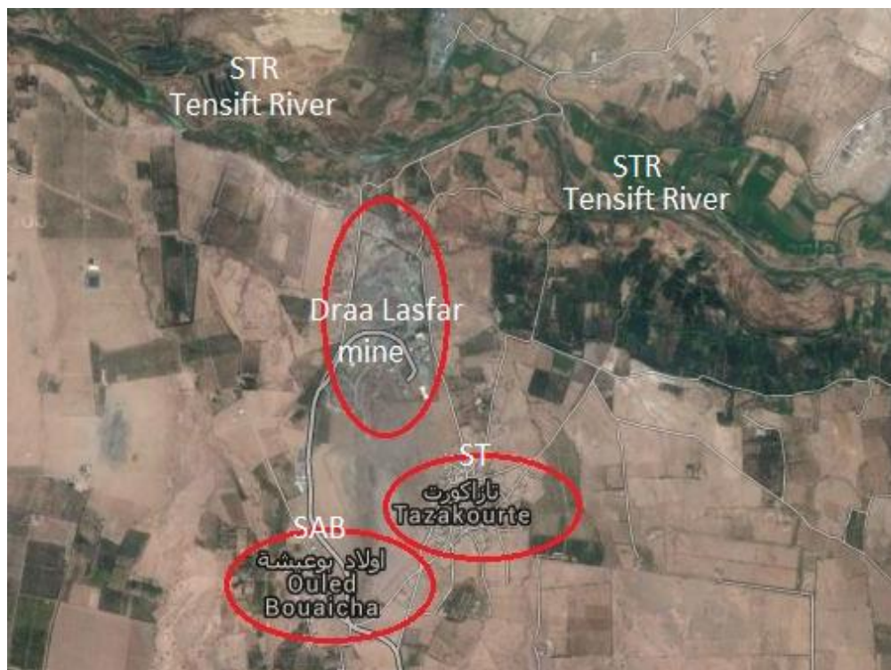
Figure 2. Geographic situation of OuledBouaicha and Tazakourte rural communities.

the mining site as control soils (background) in order to avoid mining contamination.