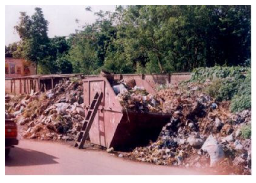
Plate 1. Skip used for collecting health-care waste in an Ibadan HCF.