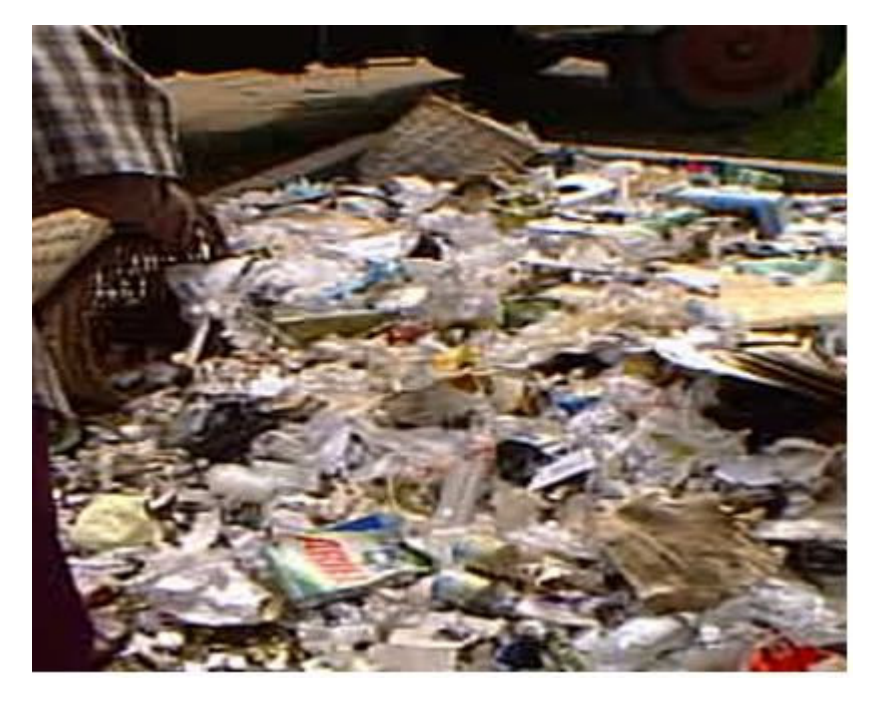
Plate 3. Temporary storage depot for healthcare waste in an Ibadan HCF.