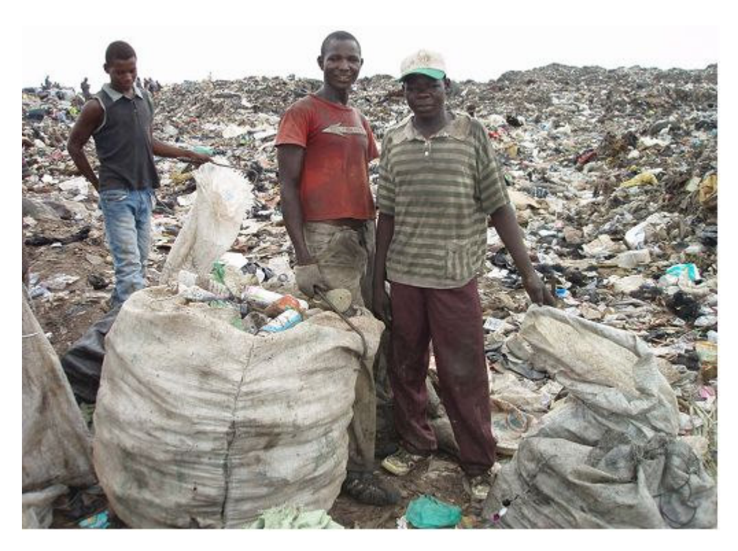
Plate 5. Scavengers susceptible to health risks at Aba-Eku, Ibadan.

Note: X indicates identified health risks.