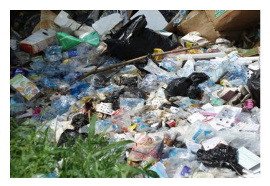
Plate 2. An open dump beside one HCF in Ibadan.