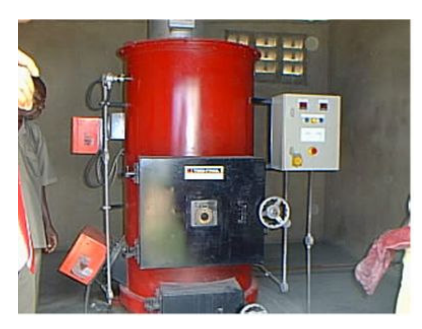
Plate 4. Over-utilized incinerator at UCH Ibadan.

cost of operating and maintaining them. The study of Coker et al (2000) revealed that acute pollution of the nearby surroundings stemmed from the high concentration of plastics and absorbents components of the HCW generated in UCH. Another problem with the quantity of UCH incinerator (Plate 4) is the small capacity (capable of burning 25 kg/hr) which makes it unable to cope with the HCW with which it is being overcharged. This incinerator was imported from Britain which did not last long before it was out of function and maintenance and getting spare parts has been a problem. The work of Sridhar and Coker (2009) recommended that while selecting the management method, the technical, human and financial resources of each facility should be kept in mind.