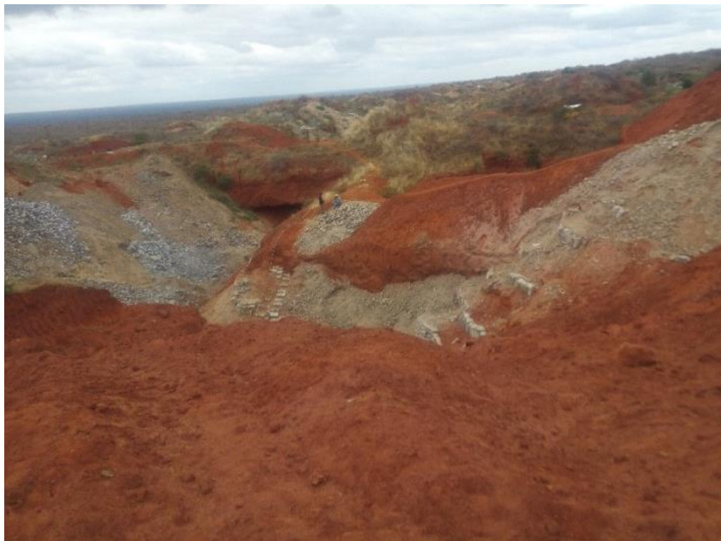
Figure 9. Abandoned mining pits.