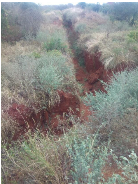
Figure 7. Abandoned mining trenches

effects, which could negatively affect the workers in the mining sector.