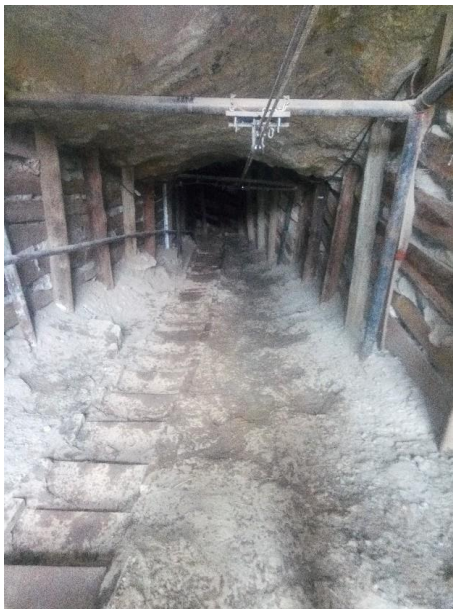
Figure 3. Horizontal tunnels and shafts.

The landscape is heavily impacted by drilling of holes, blasting, transportation and usage of heavy machines in the initial stages of the mining process (Brahma, 2007).