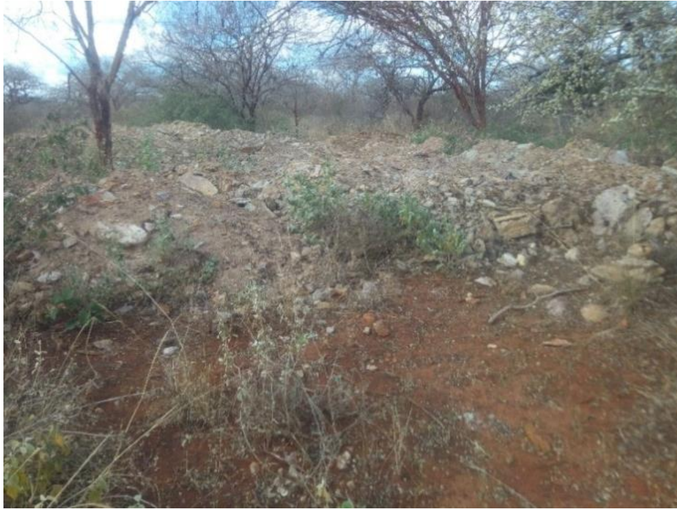
Figure 8. Damaged vegetation cover.