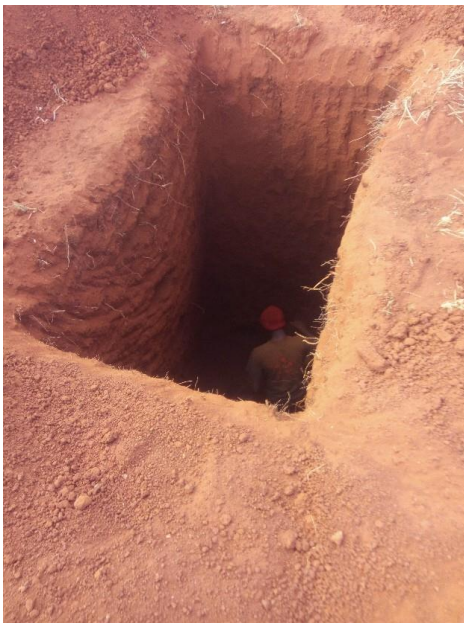
Figure 5. Deep in the ground.

included general categories of trees, shrubs and grass. Also, animal life around the mining area was observed. Observation from all the nine mining sites revealed similar characteristics where trees, shrubs and grass were sparsely populated (Figures 7 and 8 and Table 4). In surface and open pits mining, there was no grass as the method involved the removal of the topsoil that was fertile and supported the growth of land cover. Livestock life