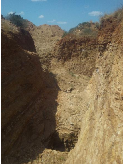
Figure 4. Strip mining.