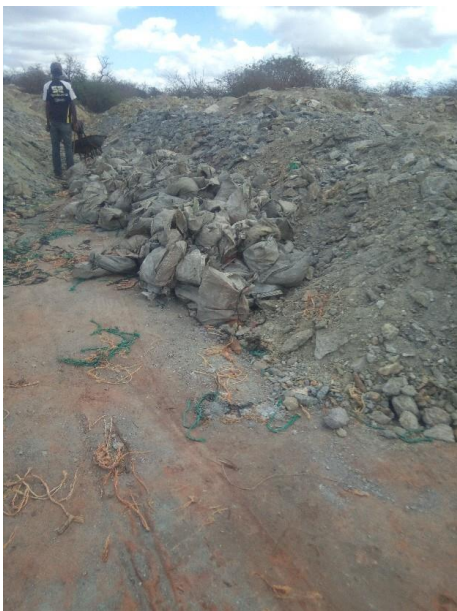
Figure 6. Dump piles.