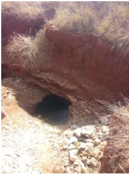
Figure 2. Open pit.