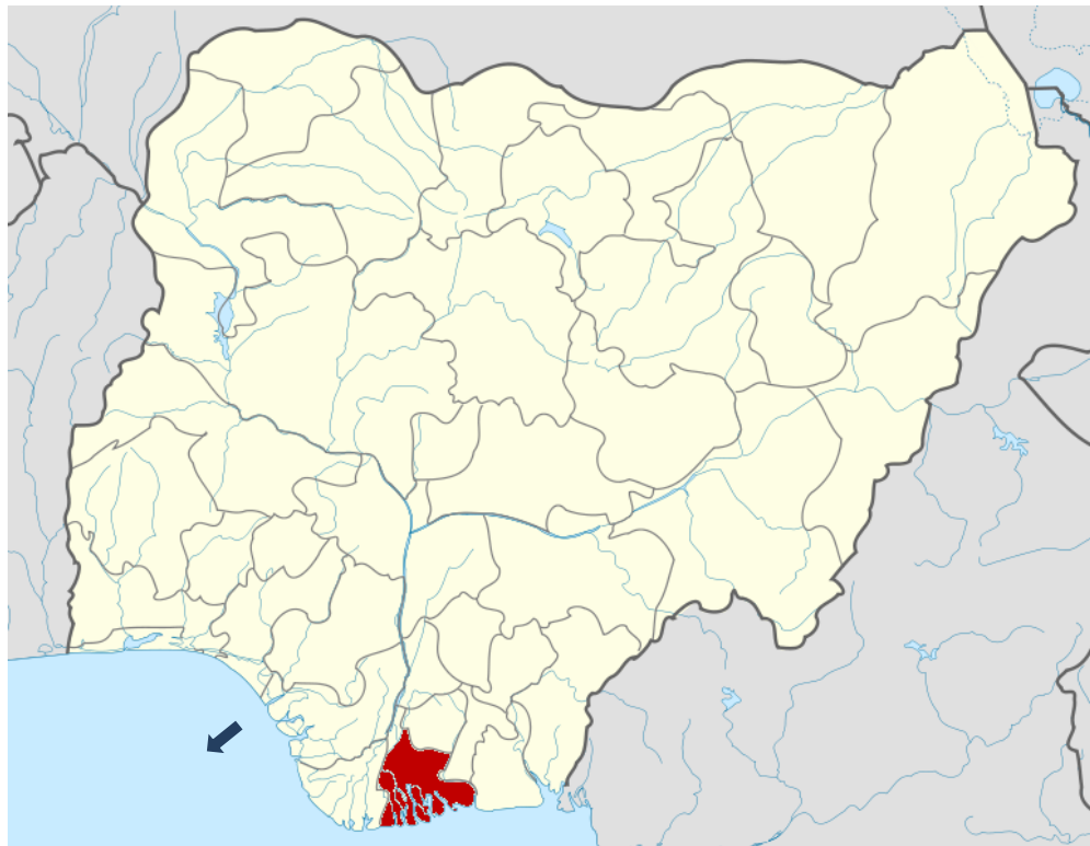
Figure 1. Map of Nigeria showing Rivers State.