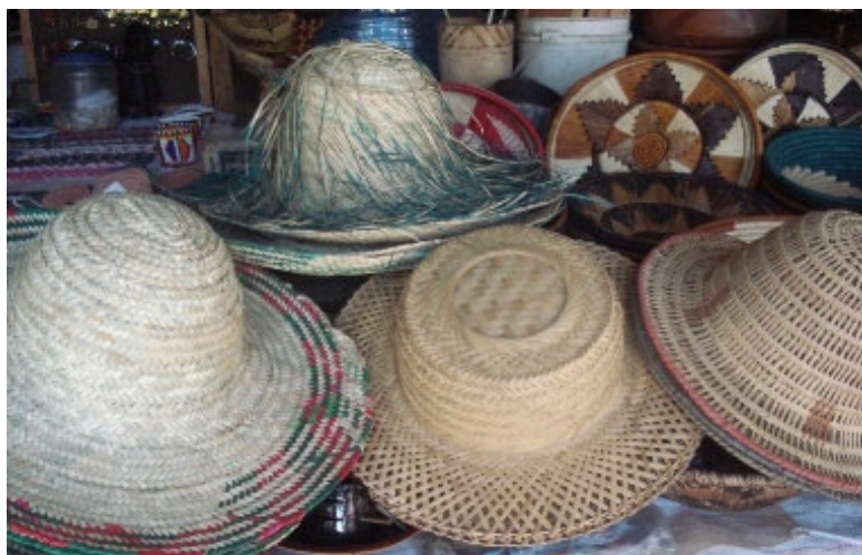
Figure 4. Hats made from water hyacinth plants.