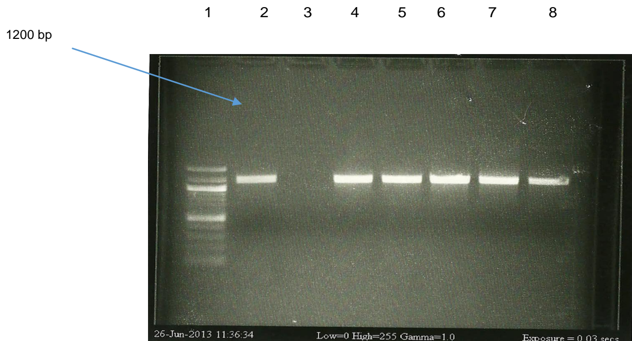
Figure 2. Gel electrophoresis of PCR product of 16 S RNA gene amplified with universal primer (lane 1= 100 bp DNA ladder, lane 2, 4, 5, 6, 7, 8= Amplified PCR product (1200 bp) positive samples, lane 3=negative control).