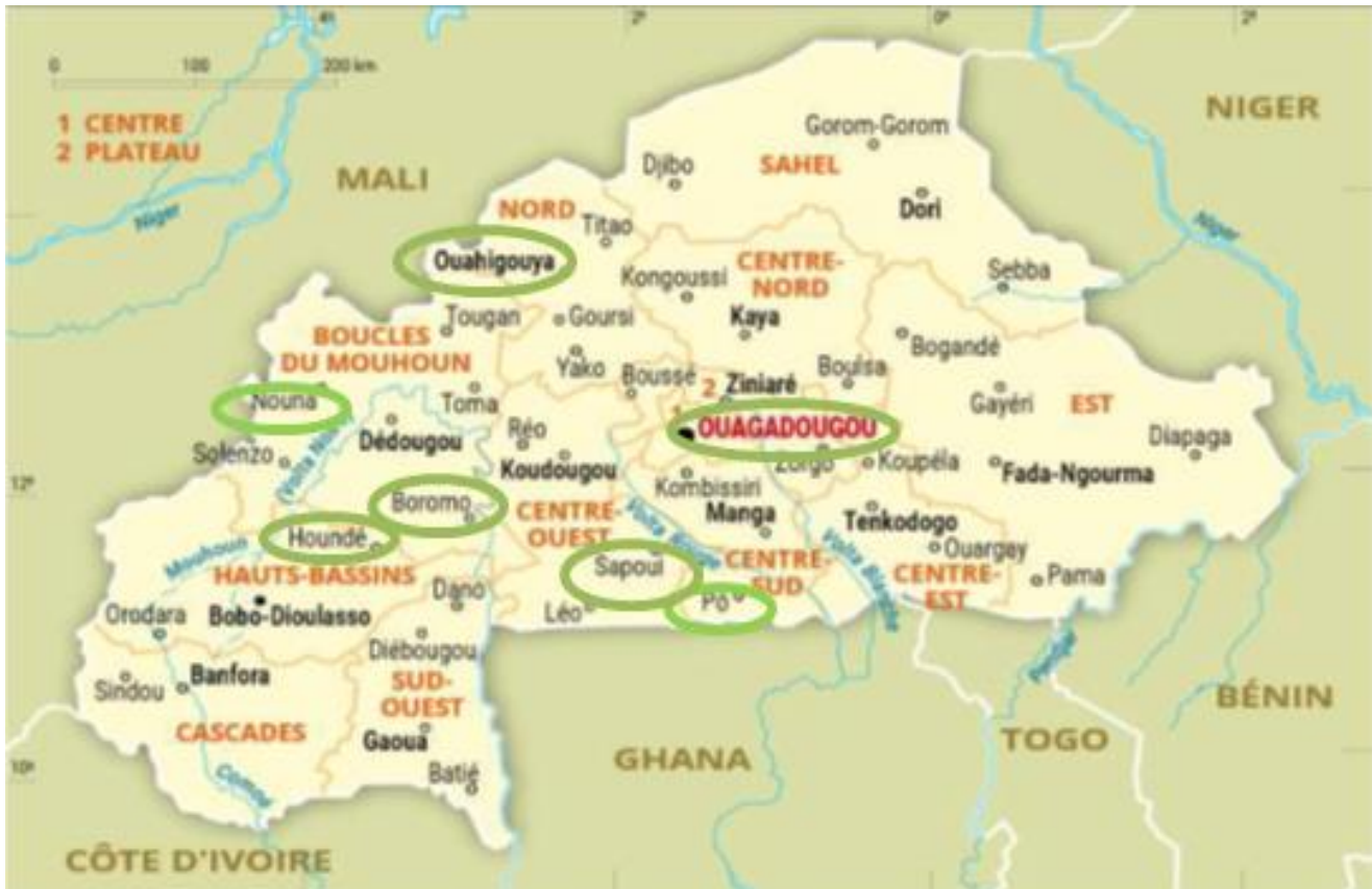
Figure 1. Map of Burkina Faso showing the seven sampling areas. Green circles indicate the localities and their names.

Kouakoua et al., 2019). Ripe fruit is tasty, sweet-sour with yellow pulp (Boamponsem et al., 2013) and is generally consumed fresh without any processing. However, the fruits could be processed into products such as juice, nectar or jam. It could also be used in other preparations such as cakes (Kouakoua et al., 2019). The fruit is rich in vitamin A, vitamin C, dietary fiber and contains minerals such as potassium, magnesium and calcium (Omale et al., 2010; Diabagaté et al., 2019). The presence of active compounds in Saba fruit could play an important role in the prevention and treatment of certain vitamin deficiencies and metabolic diseases (Kini et al., 2008). Despite its intrinsic qualities and its economic contribution, the valorization of the S. senegalensis fruit as most of climacteric fruits in Burkina Faso is limited by its seasonality and its high perishability. Indeed, the fruit harvesting period is three months (May to August) and once at maturity, the fruit storage time is very short and usually does not exceed three days (Lamien et al., 2010). In addition, the lack of methods of processing as well as methods of preserving the fruit results in its non-availability throughout the year. The objective of this study was to determine the biochemical composition of the pulp and the hull of S. senegalensis fruit for a better valorization in Burkina Faso.