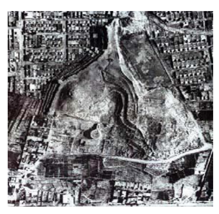
Figure 1. A landscape of Rashidi complex.

the religious foundation (abwab al-birr) comprised two areas: the one in front had ramparts (baru) and was built as a gateway (dargah) accompanied by minarets attached on its sides; the one in back had another entryway (darvaze) and also had baru. The front and back ramparts were attached to unite the two areas, and Rashid al-Din designated the whole as the Rabe Rashidi (Blaer, 1984: 67-90).