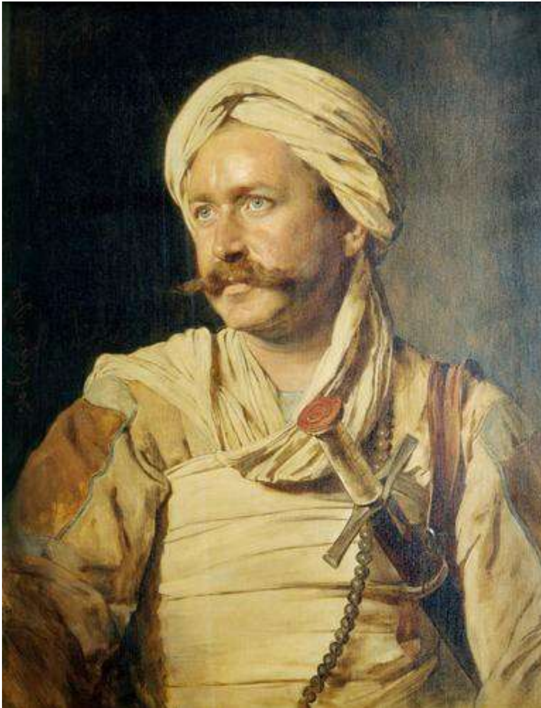
Figure 6. Life-size, head and shoulders of von Slatin in his Dervish dress commissioned by Queen Victoria. Portrait by Heinrich von Angeli (1840-1925) who was paid £263 5s for the portrait on 4 December 1895. Signed and dated 1895.

on the Hofret deposit using a Geiger counter which indicated a high level of radio activity but made no