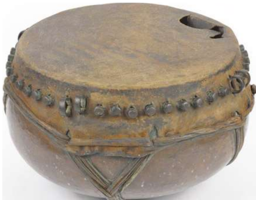
Figure 2. Beaten copper and leather drum, the ownership of which was a mark of authority and social standing in Darfur (Source: National Army Museum Study Collection Accession Number NAM 1963-05-13-1 ( https://collection.nam.ac.uk/detail.php?acc=1963-05-13-1 ); The illustrated drum is reputed to have been taken as a trophy after the defeat of the Dervish forces at the Battle of Omdurman in 1898).