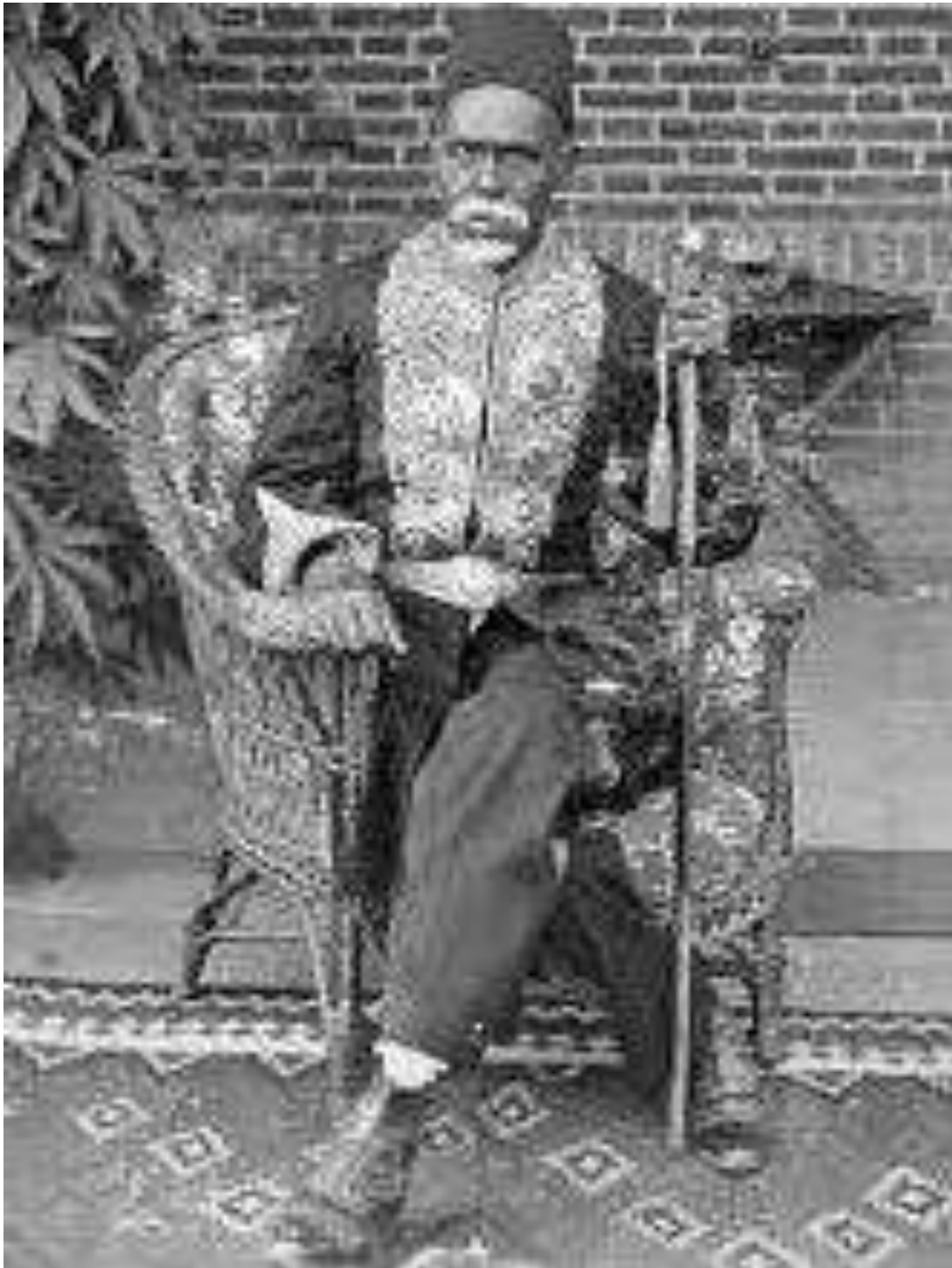
Figure 3. Portrait of al-Zubayr when Governor of Bahr el Ghazal.