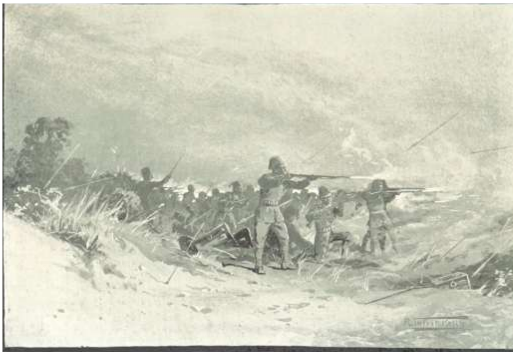
Gessi Pasha's Troops advancing to the attack on "Dem Suleiman."

Figure 4. Troops of Romulu Gessi attacking Deim Suleiman. Painting by R Talbot Kelly.