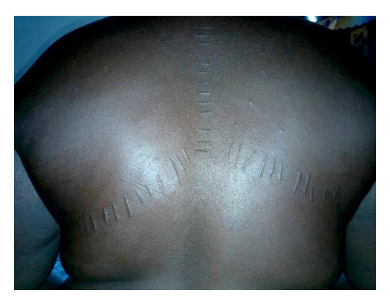
Figure 2. Wojiatsɛmɛi a gbɛ on the back of initiates.

received counsel from the gods that guided him. The wojiatsɛmɛi a gbɛ is a mark that has its fons et origo from a story similar that of the Myth of Adapa , where initiates or devotees, bound to eternal servitude, heed to the counsel of the divinities and deities they serve. These are marks that are done by the devotees and initiates of wojii or jemawoji (Figures 1 and 2) and these are people who decide to go into priesthood or are 'caught' into priesthood (caught in a sense that a deity may choose that particular individual as a channel through which it would want to communicate with the people).