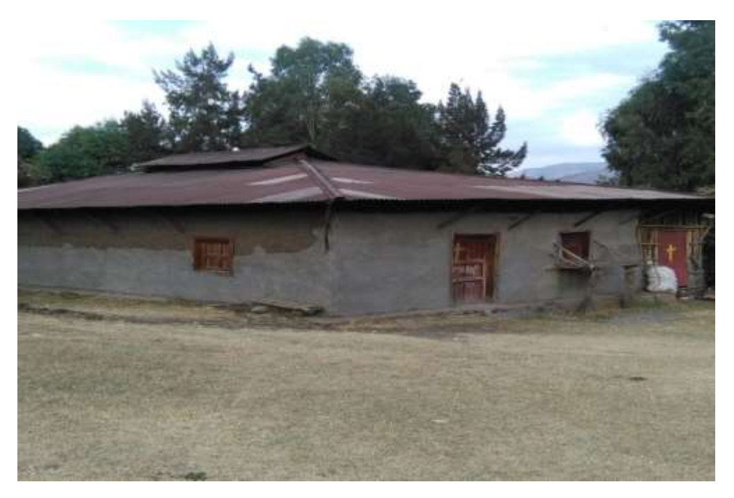
Figure 5. The Tegbar bate (Refectory).

does not have its own website that can help to promote its resources; however, they did not promote the tourism resources either through printing or electronics media due to lack of finance and trained man power. Even there is no single billboard on the way to the monastery or in the nearby town of Haiq to indicate the direction where the monastery is located. Due to this and other related hindrances, all the innumerable and priceless heritage of the monastery became inaccessible for domestic and international tourists.