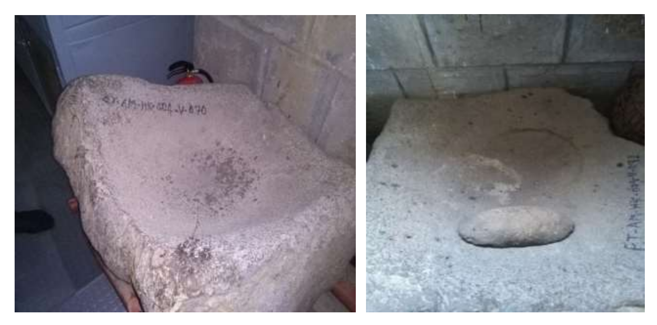
Figure 3. Sacrificing stone and millstone.

conducted during the reign of Emperor Haile Sillase (Aba Birhane Hewt interviewed on November 2016). The house had been used as a kitchen; Abune lyesus Moa, the founding father and Abune Teklhaymant one of his famous fellow cooked grain and prepared food for other monks in this historic house. The house was built of wood, mud and stone while its roof was covered by grass. It has five wooden windows and two wooden doors. The interior part has two sections and in one of the interior section there are two erected timbers which have been used as pillar of the house and now testify about the oldness of the house (informant, Aba Gebre Medhin, interview on November 2016). Currently, some part of the exterior wall is covered by cement. The roof is also changed and covered by corrugated iron sheet; meanwhile its function is still unchanged. In the monastery there is division of labor, but all monks consumed the same types of food without considering status and age. Those monks who take the responsibility of food preparation cook the meal for the entire monks in this historic house and every monk except the aged take the allotted food there.