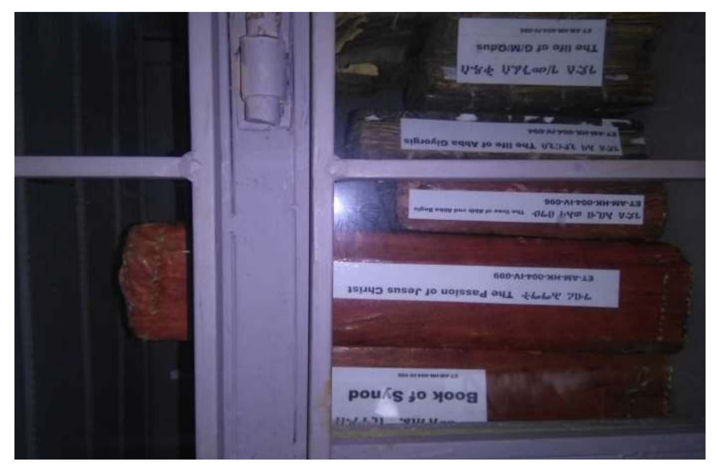
Figure 1. Some parchment manuscript books within the museum show case which one put over the other.

The other stunning heritage in the museum is pulpits. These pulpits are made from one pieces of wood and it can be folded and opened. They are used or served for the purpose of reading of holy books which are very cumbersome for handling (informants Aba kidane Maryam and Aba Kinfe Michael, interviewed on September 2016).