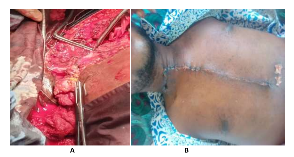
Figure 5. a and b showing evacuation of blood from the sac, repair of the defect and 7<sup>th</sup> day postoperative status respectively.

Figure 4. a and b showing the operative repair of the aneurysm after obtaining proximal and distal vascular control.