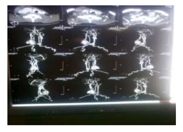
Figure 3. Digital subtraction angiography showing the aneurysm.