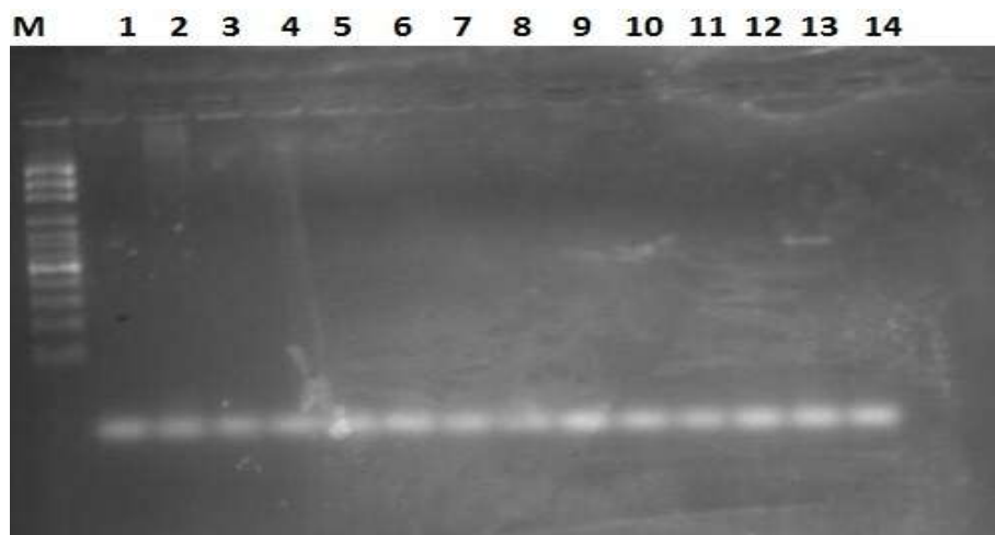
Figure 1. Salmonella -specific PCR (16S rRNA) of isolates from wastewater. Lane M: 100 bp DNA, Lane 1: Negative control, Lane 2: Positive control ( S. Typhi ), Lane 3-14: samples, Lane 9, 10 and 13 reveals amplification of 574 bp fragments of 16S rRNA gene.

occurrence of 11.09% of Salmonella species in wastewater. Conversely, a report by Howard et al. (2004)