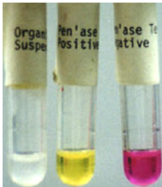
Figure 3. \beta -Lactamase production with acidimetric method.

to red (Jalalpoor et al., 2007; Washington et al., 2006) (Figure 3). B. cereus has been regarded as a relatively nonpathogenic opportunist commonly associated with enterotoxin mediated diarrheal food poisoning (Beecher et al., 1995; Blaser et al., 1993; Beveridge, 1997). B. cereus strains produce one emetic toxin and three enterotoxins (Granum et al., 1997; Washington et al., 2006). This organism has been increasingly isolated