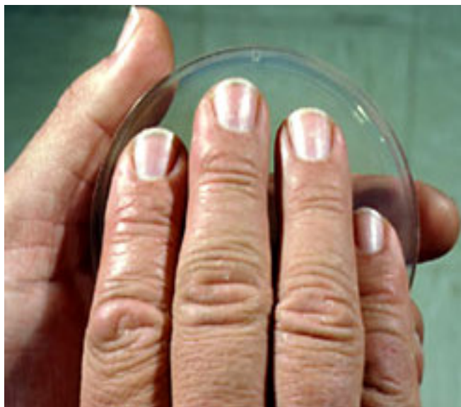
Figure 1. Separated staff hands specimens with fingerprint technique.