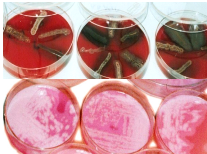
Figure 2. B. cereus on a plate of blood agar and B. cereus selective base agar.

to red (Jalalpoor et al., 2007; Washington et al., 2006) (Figure 3). B. cereus has been regarded as a relatively nonpathogenic opportunist commonly associated with enterotoxin mediated diarrheal food poisoning (Beecher et al., 1995; Blaser et al., 1993; Beveridge, 1997). B. cereus strains produce one emetic toxin and three enterotoxins (Granum et al., 1997; Washington et al., 2006). This organism has been increasingly isolated