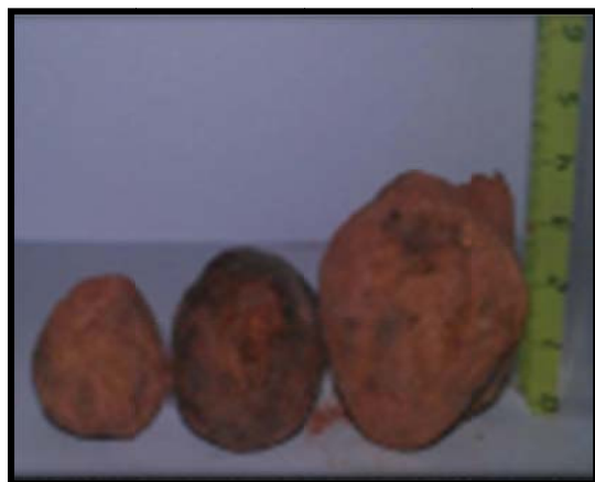
Figure 1. Ascocarps of the desert truffle, Terfezia boudieri Chatin taken with a digital still camera DSC-W.

Ferdman et al., 2005; Kovacs et al., 2008; Trappe et al., 2008). They include several genera: Balsamia , Delastria , Eremiomyces , Elderia , Kalaharituber , Leucangium , Mycocleandia , Mattiolomyces , Phaeangium , Picoa , Reddelomyces , Terfezia , Tirmania and Ulurua (Morte et al., 2008; Trappe et al., 2008; Jamali and Banihashemi, 2013).