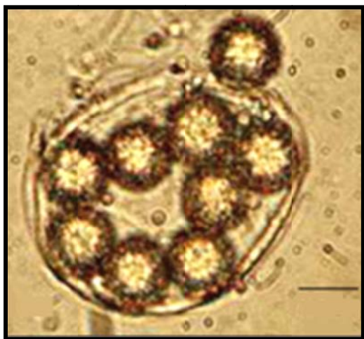
Figure 2. Ascus of Terfezia boudieri containing 8 ascospores observed under light microscope (bar = 25 \mu m).