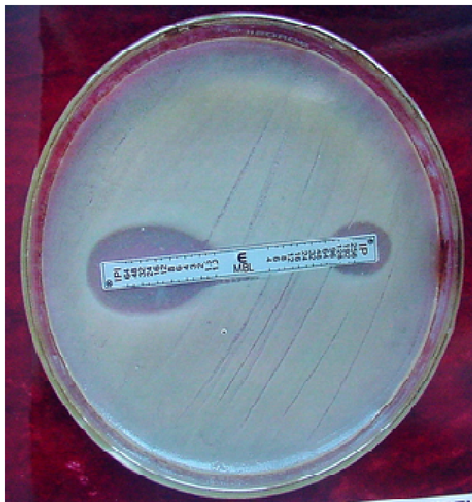
Figure 4. E-test demonstrating reduction in MIC of imipenem in the presence of EDTA.

are several years away from the development of a safe therapeutic antibiotic; their continued spread would be a clinical disaster. The occurrence of an MBL positive isolate poses not only a therapeutic problem but is also a serious concern for infection control management. As a result of being difficult to detect, such organisms pose significant risks particularly due to their role in unnoticed spread within institutions and their ability to participate in horizontal MBL gene transfer, with other pathogens in the hospital (Agarwal et al., 2006). The present study was conducted with above perspective in view to know the prevalence of MBL producing P. aeruginosa , to find the associated risk factors and possible treatment alternatives.