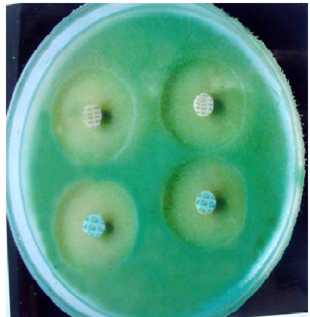
Figure 3. P. aeruginosa ATCC 27853 shows no zone size enhancement with EDTA-impregnated imipenem or ceftazidime disks.