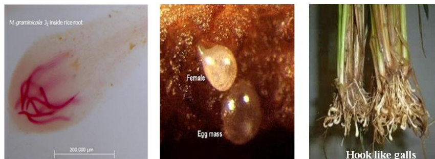
Figure 1. Characteristic hook like galls stained with acid fuchsin showed numerous number of M. graminicola juveniles.